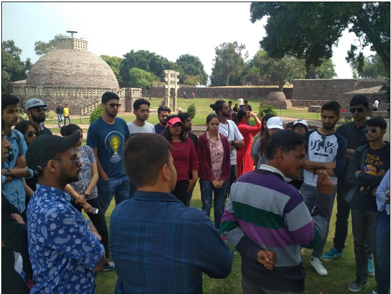
Picture 7: Tour Guide explaining the facts about Stupa at Sanchi and others part around the globe, Sanchi, Madhya Pradesh

The visit extended to nearby resort named Jungle Resort, maintained by Madhya Pradesh Tourism Department, which helped students to look at various kinds of services and functional spaces that can be provided while designing a resort.