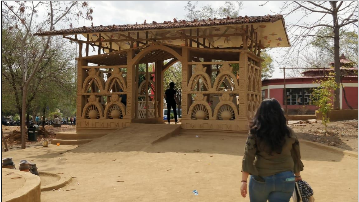
Picture 5: Indira Gandhi Rashtriya Manav Sangrahalaya, Bhopal, Madhya Pradesh

At Indira Gandhi Rashtriya Manav Sangrahalaya, students documented vernacular architecture from different tribal / rural regions of India.