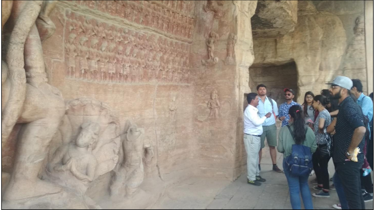
Picture 8: Tour Guide explaining the facts about Caves developed at Udaygiri, near Sanchi, Madhya Pradesh