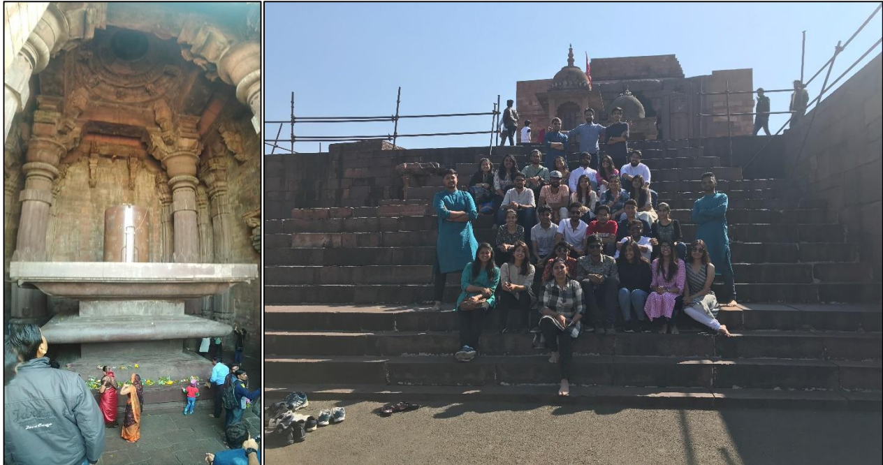
Picture 9: Tour Guide explaining the facts about Caves developed at Udaygiri, near Sanchi, Madhya Pradesh

On the fourth day, the group visited the heritage sites at Bhojpur. The group encountered various facts about the temple complex. Students explored about the facts of the incomplete temple housing the largest Shivlinga and archaeological remains of the temple elements carved on the rocks.