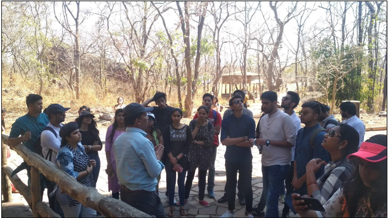
Picture 10: Tour Guide explaining the facts about Bhimbetika rock shelter, Madhya Pradesh

The second site visited was Bhimbhetka Rock shelter – study of the oldest evident traces of human life and cultural evolution through paintings done by pre historic man almost 30000 years ago.