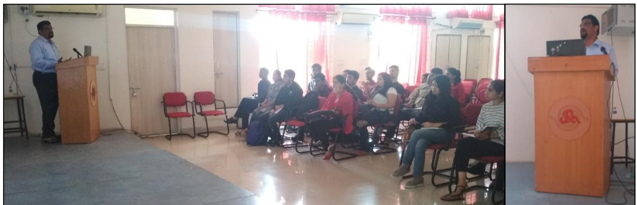
Picture 2: Prof. Sandeep Sankat, delivering lecture on universally accessible design approaches