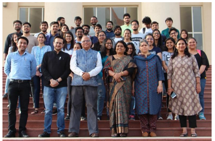
Glimpses of the Seminar