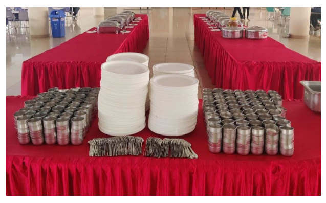
The culinary services are encouraged to use Non disposable cutlery in Administration and Academic.