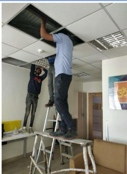
AC Unit installation in Purchase Office

Construction contractors follows minimisation policies, controlling over waste and using minimum resources.