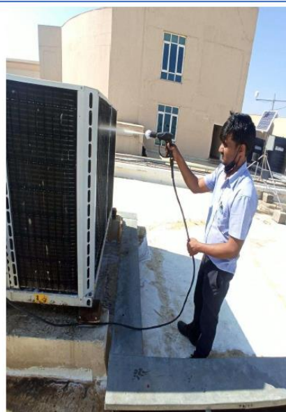
Chiller Cleaning – Right Wing