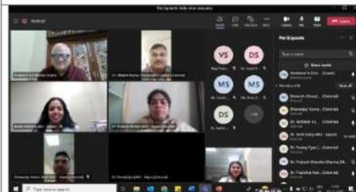
Interaction of Faculty of IT Dept.