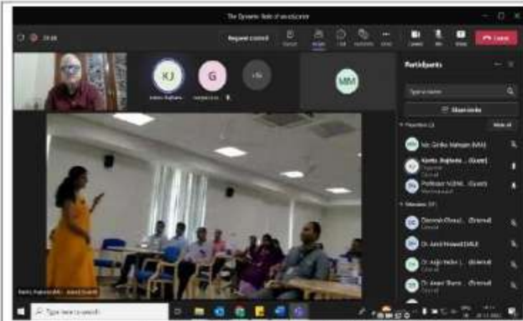
Faculty Interaction with Expert