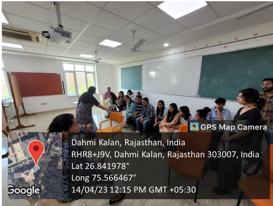
Interactive session between industry expert and students