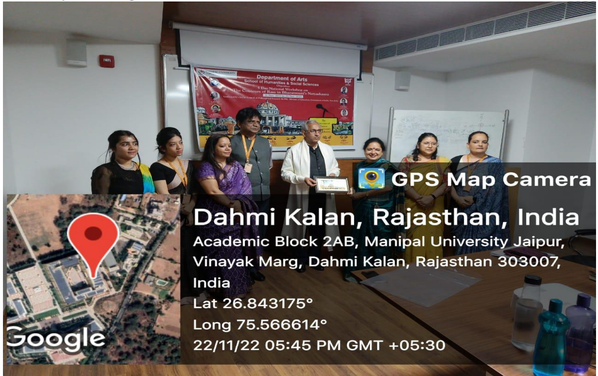
Expert being facilitated