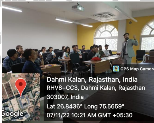
Day1- Rules and Regulation