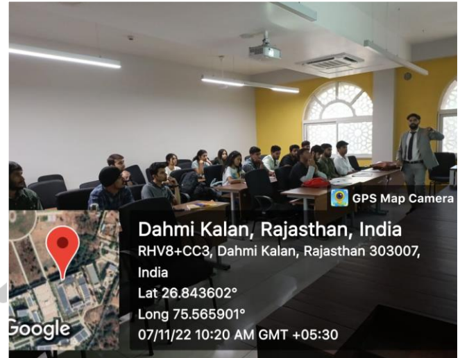
Day1- Practical Exposure to Students