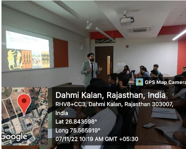
Day1- Introduction to track and field