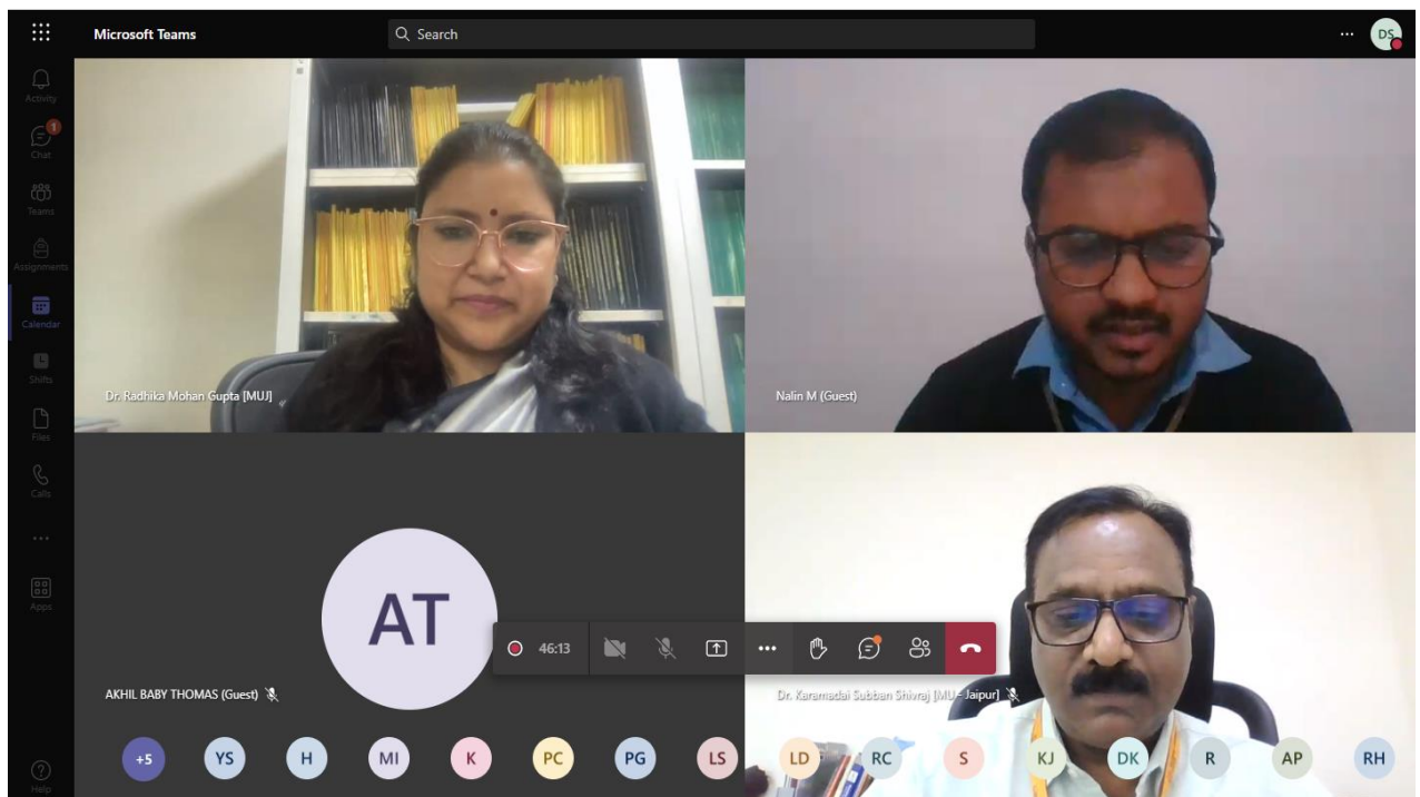
Conclusion of the lecture