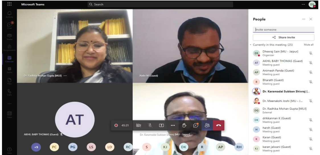
Welcome of the resource person by the Chief librarian