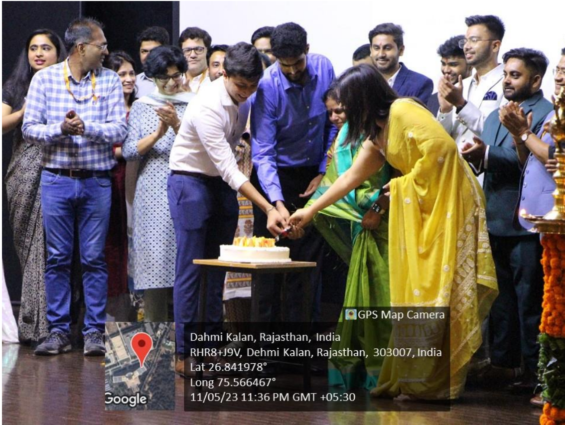
Figure 2: Cake Cutting Ceremony