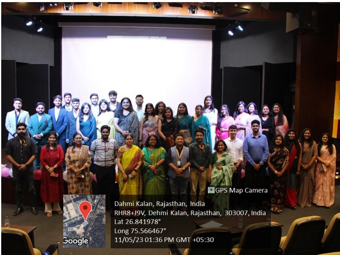
Figure 5: Group Photograph - Post Event