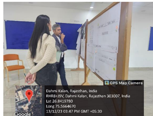
Expert engaging the students of B. Arch. Third Year