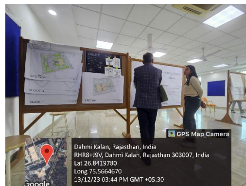
Interactive session between industry expert and students