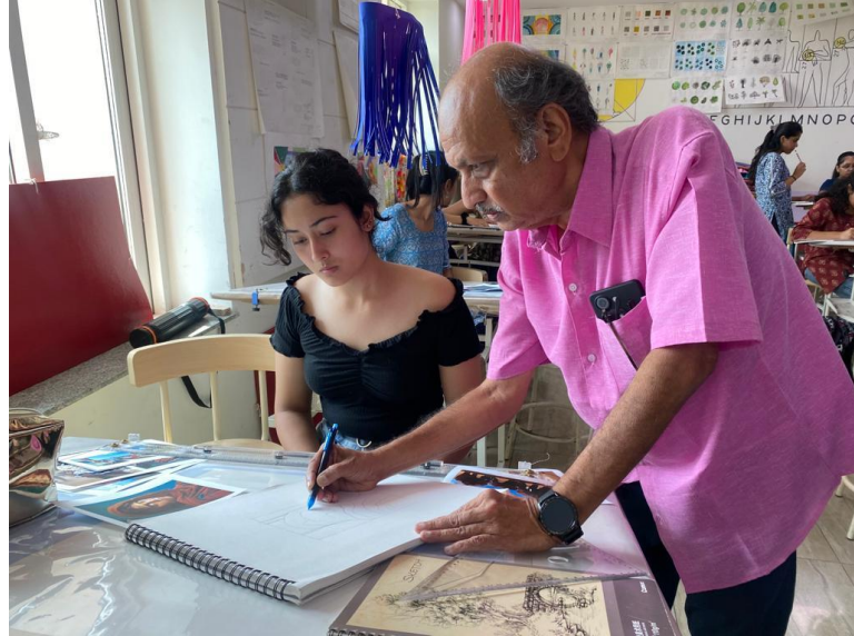
Discussions with the students