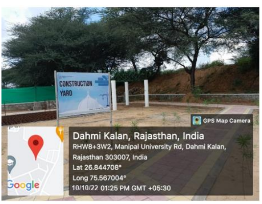
Brick bond prepared in Workshop