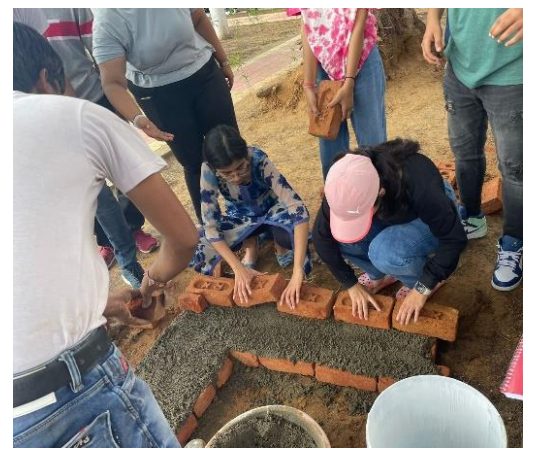
Brick bond preparation by Students in Workshop