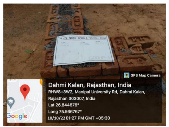
Workshop At Construction yard, MUJ, Japur