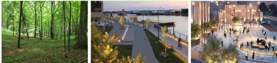
Figure 5: Event Photograph (Ar. Aparna Bhargava)