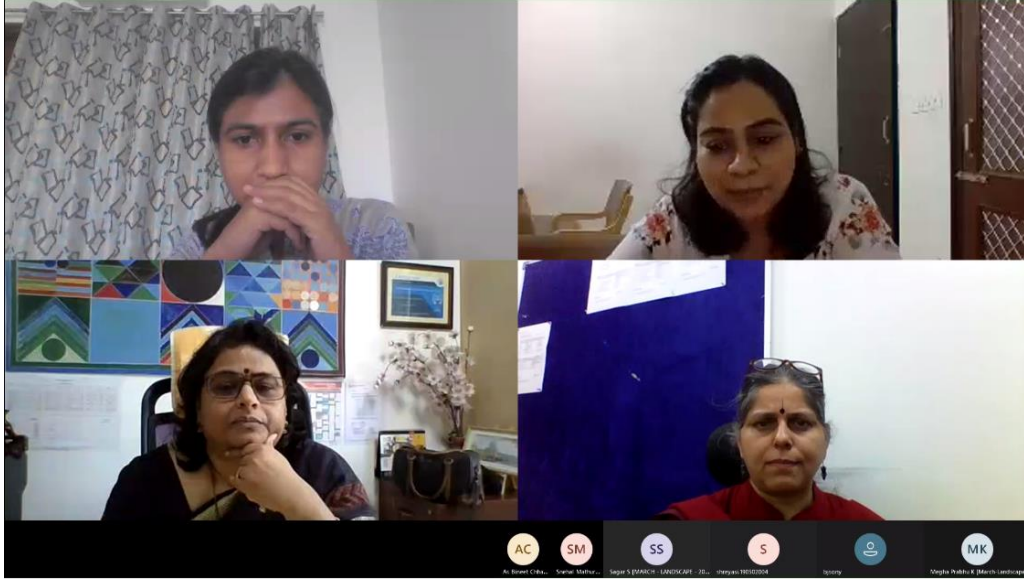
Figure 2: Event Photograph (Discussion Session)