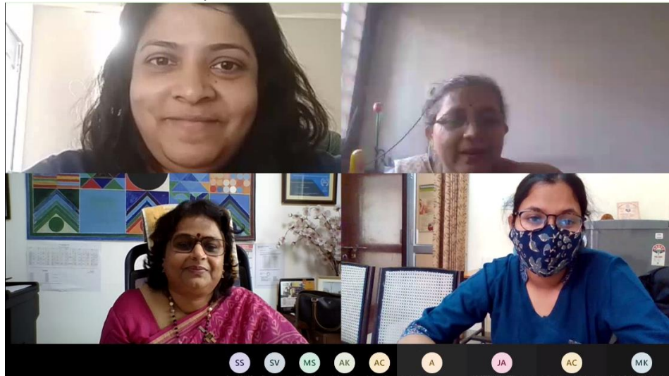
Figure 2: Event Photograph (Discussion Session)

and Climate Change has 30 years of professional, research & teaching experience in the fields of Architecture, Landscape Architecture & Environmental Planning; areas of special interest: conservation of biodiversity in urbanized environment; hill area development. Have been engaged in many national projects addressing aspects of Planning in Eco-Sensitive Zones, Environmental Impact Assessments of Townships etc. (Environmental Assessment for Mayur Vihar District Center, DDA; Saraswati Ghat Development, Allahabad; GAP; Planning for Dwarka Sub-City, DDA; EIA of CBD – Shimla; HUDCO, Regional Environmental Assessment of Western Himalayan Districts, IWDP; EIA of Industrial Townships, LIDA; Rejuvenation of wetlands, Delhi Cantonment; Zonal Master Plan for Mount Abu Eco-Sensitive Zone, Rajasthan; Vision Document for Taj Trapezium Zone, Govt. of UP; Guidelines for Urban Wetlands, NMCG ). Research studies on Techniques for sustainable development in Mountain Areas for MHRD, Environmental aspects of Lakes and their catchment, Udaipur for MoEF, Energy Planning for Mountain Districts; Kullu. Supervised three Doctorates addressing areas of low carbon cities, environmental regionalism, and environmental optimization of open spaces. Currently supervising research in areas of vegetation and air pollution; water management, biodiversity, culture and environment and riverine ecosystems.