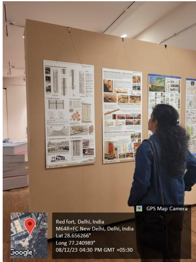
Figure 4: Spectators in front of SA&D, MUJ Panel