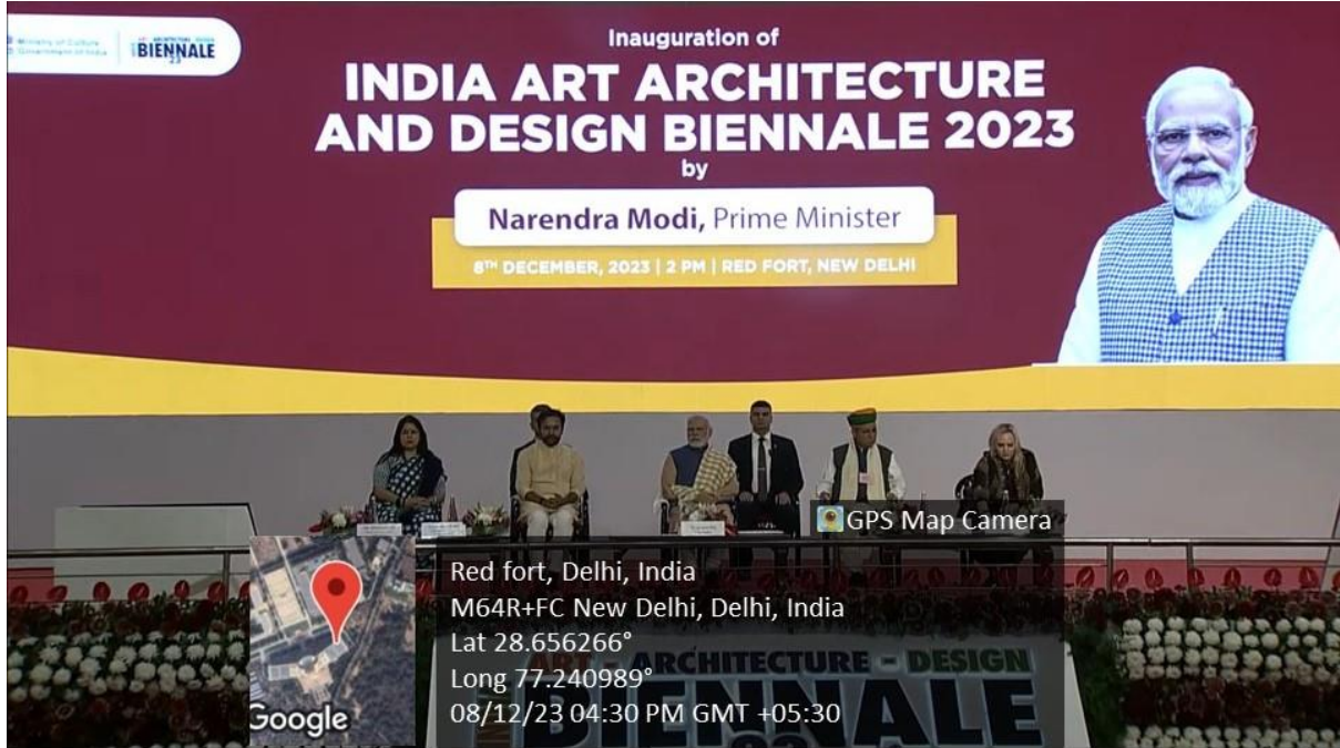
Figure 3: Honourable Ministers of Government of India and Chief Guest