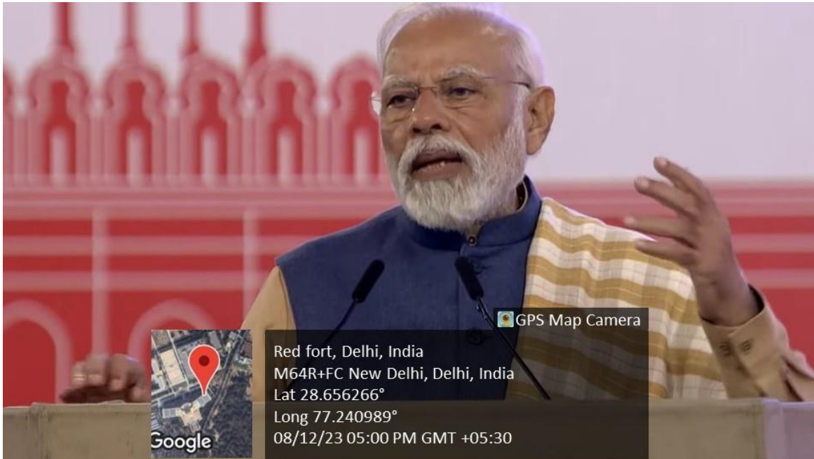
Figure 1: Honourable Prime Minister of India: Shri Narendra Modi During the IAAD Biennale' 23