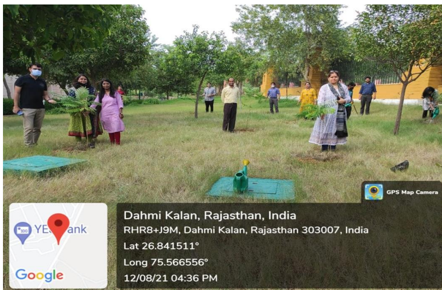
Tree Plantation by SA&D Faculty Members