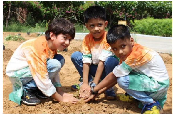
Children Participated in Plantation Drive