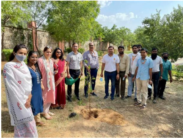
Neem tree Plantation on closing Day