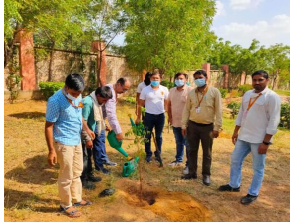
Tacoma tree Plantation on closing Day