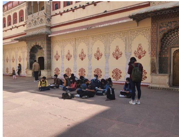
Students sketching and photo documenting City Palace