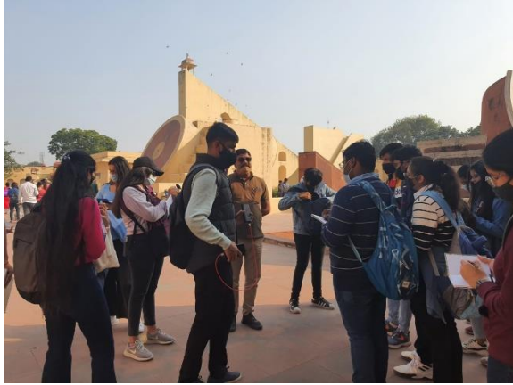
Students sketching and photo documenting Jantar Mantar