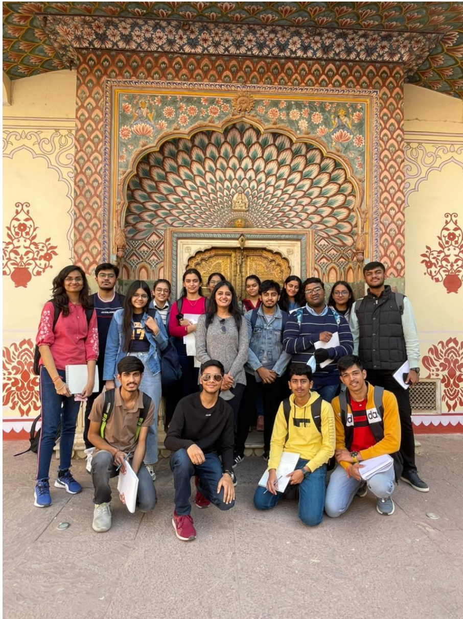
Group picture at Dancing Courtyard at City Palace