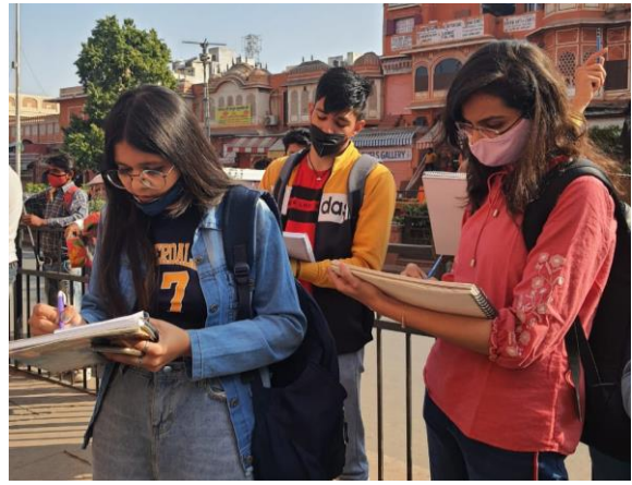
Students sketching and photo documenting Hawa Mahal