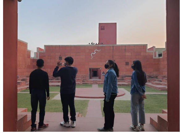
Students photo documenting Jawahar Kala Kendra