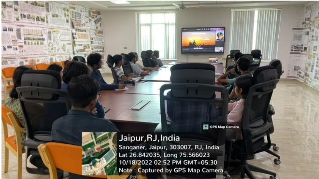
3. Students attending the lecture