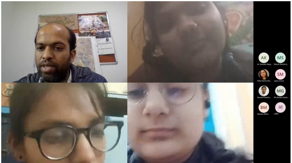
Figure. 2 Progress of school connect