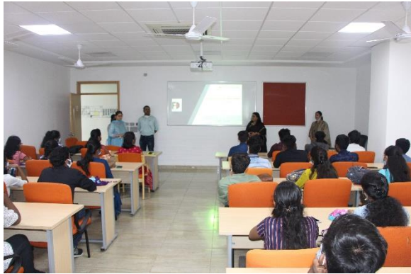
Lecture on Sustainable Practices at MUJ