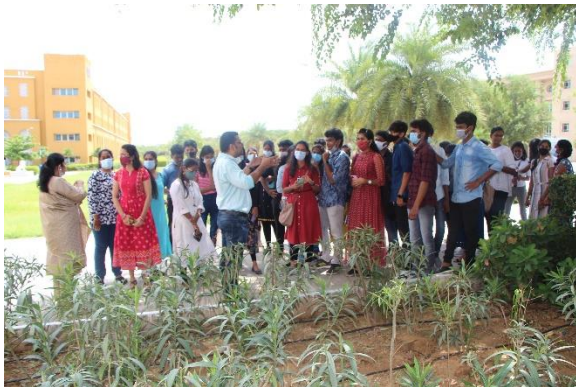
Demonstration of Sustainable Practices