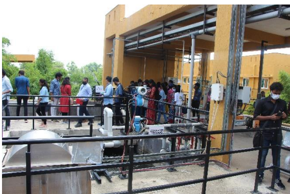
Field Visit to STP Plant