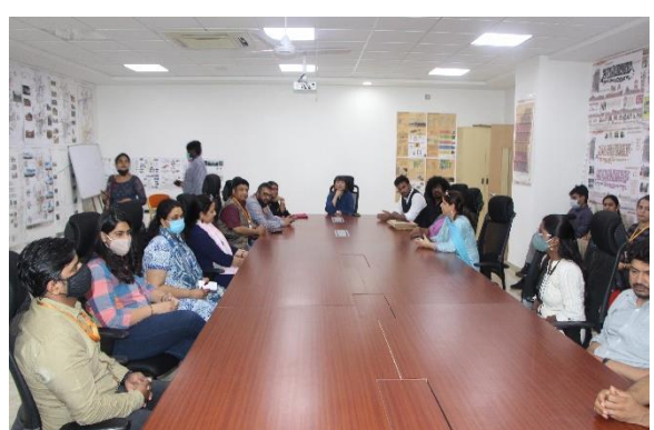
Faculty Interaction of both the institute