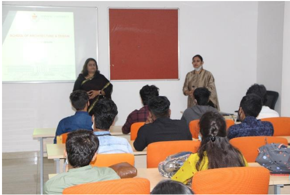
Welcome Address by Directure SA&D