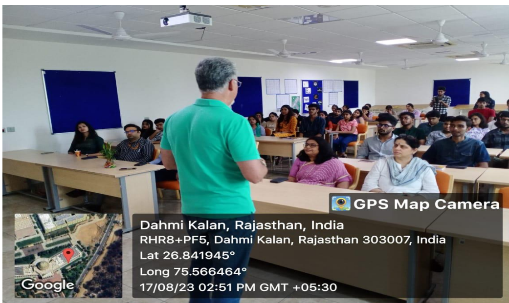
Snippets of the Workshop