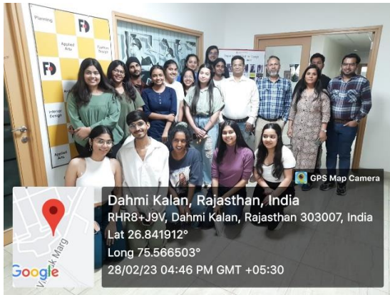
Dahmi Kalan, Rajasthan, India RHR8+J9V, Dahmi Kalan, Rajasthan 303007, India Lat 26.841912° Long 75.566503° 28/02/23 04:46 PM GMT +05:30