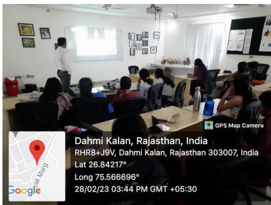
Dahmi Kalan, Rajasthan, India RHR8+J9V, Dahmi Kalan, Rajasthan 303007, India Lat 26.84217° Long 75.566696° 28/02/23 03:44 PM GMT +05:30