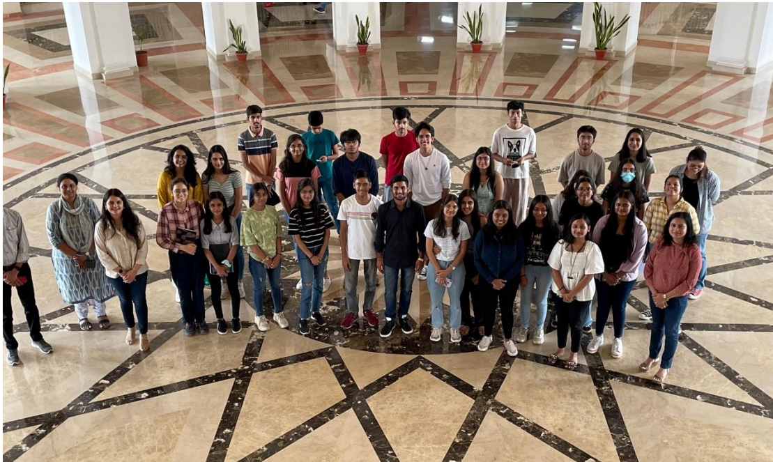
The session was ended with the wonderful group photo.