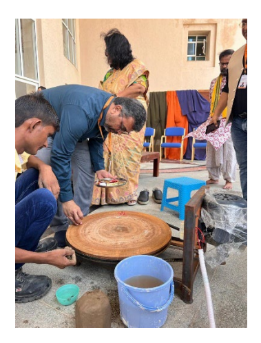
Director inaugurating the workshop