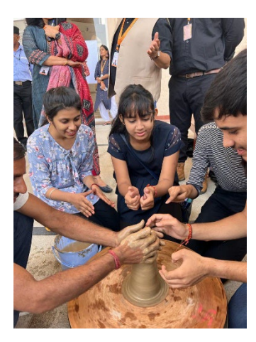
Hands-on pottery session