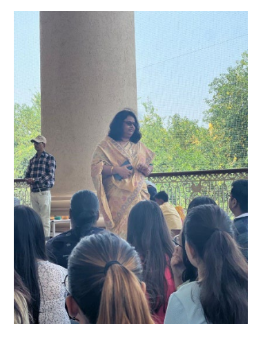
Welcome Address by Dean, FoD