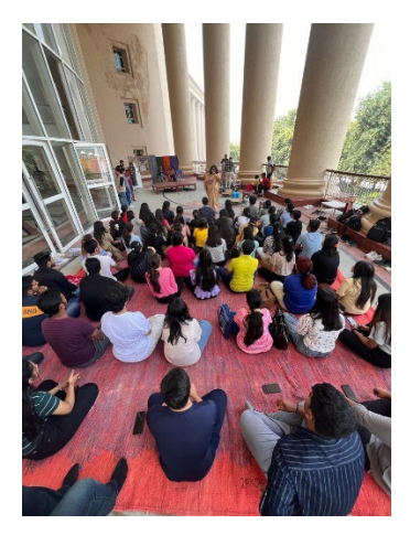
Students attending the workshop