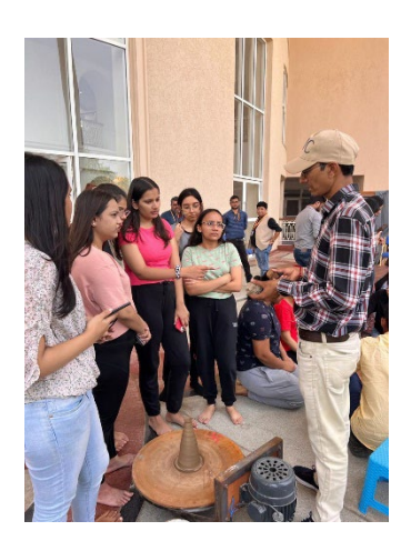
Expert guiding the students