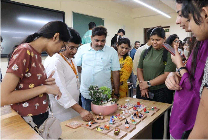
Student participant explaining their miniatures and try garden concept to the visitors