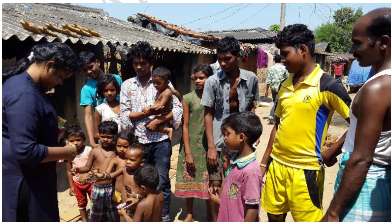
6: Discussion with craftspeople and children