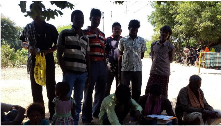
8: Participant craftspeople