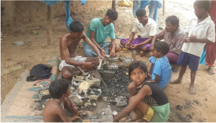
7: Craftspeople working on the product