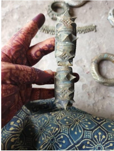
2: Bangle a product