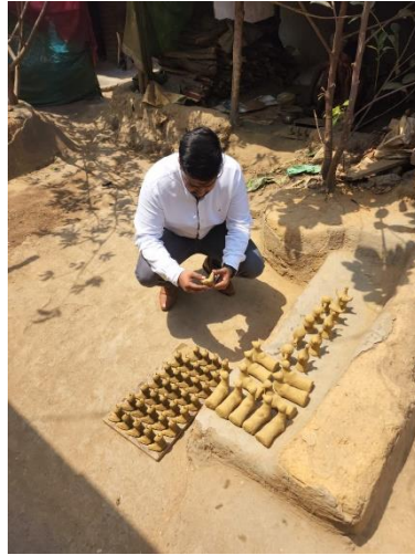
3: products under process