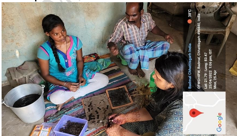
1: working with craftspeople