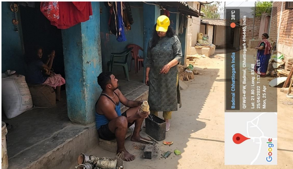
5: Discussion with craftsman on the process