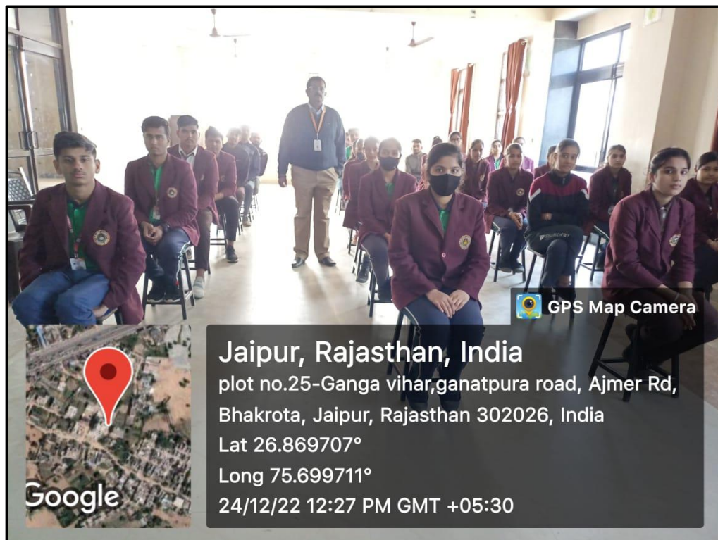
Figure 5.2 Interaction Session with Students at E Planet Academy