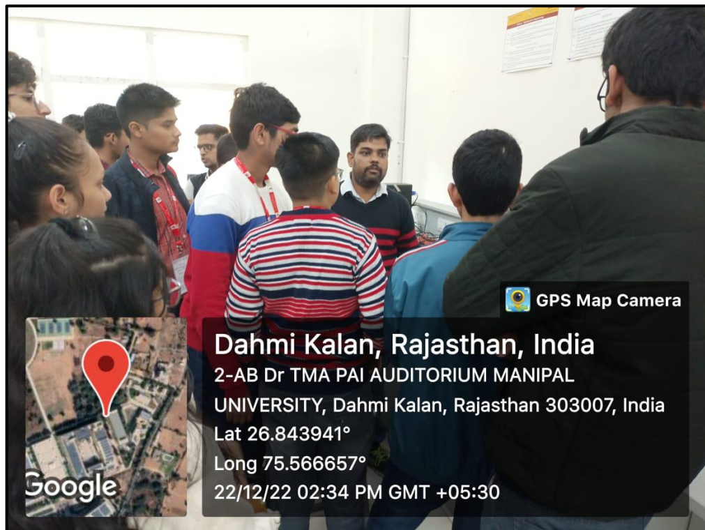
Figure 5.2 Displaying Khepra Robot Working To Students