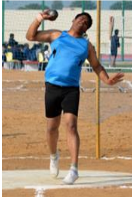
Fig 9.7.1 g Shortput Field