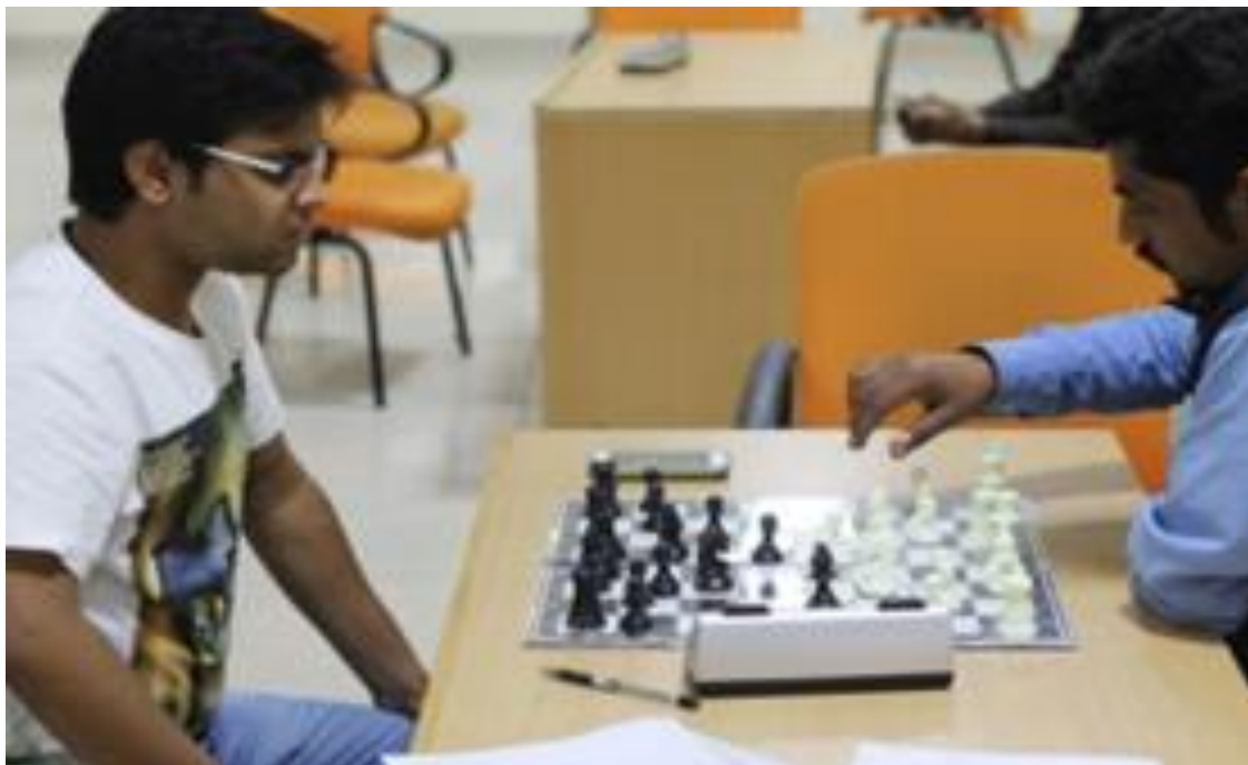
Fig 9.7.1 k chess boards