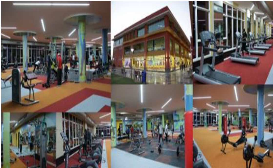
Fig 9.7.1 n Gymnasium facility for the students