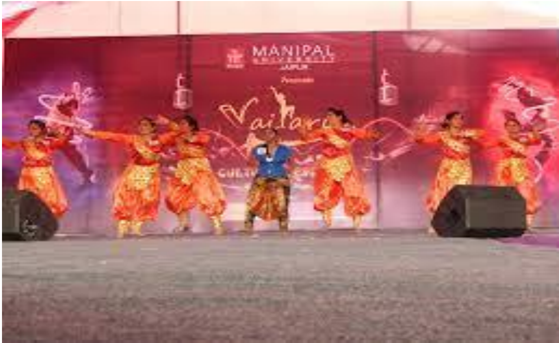
Fig 9.7.1 p (vi) Various cultural events at MUJ