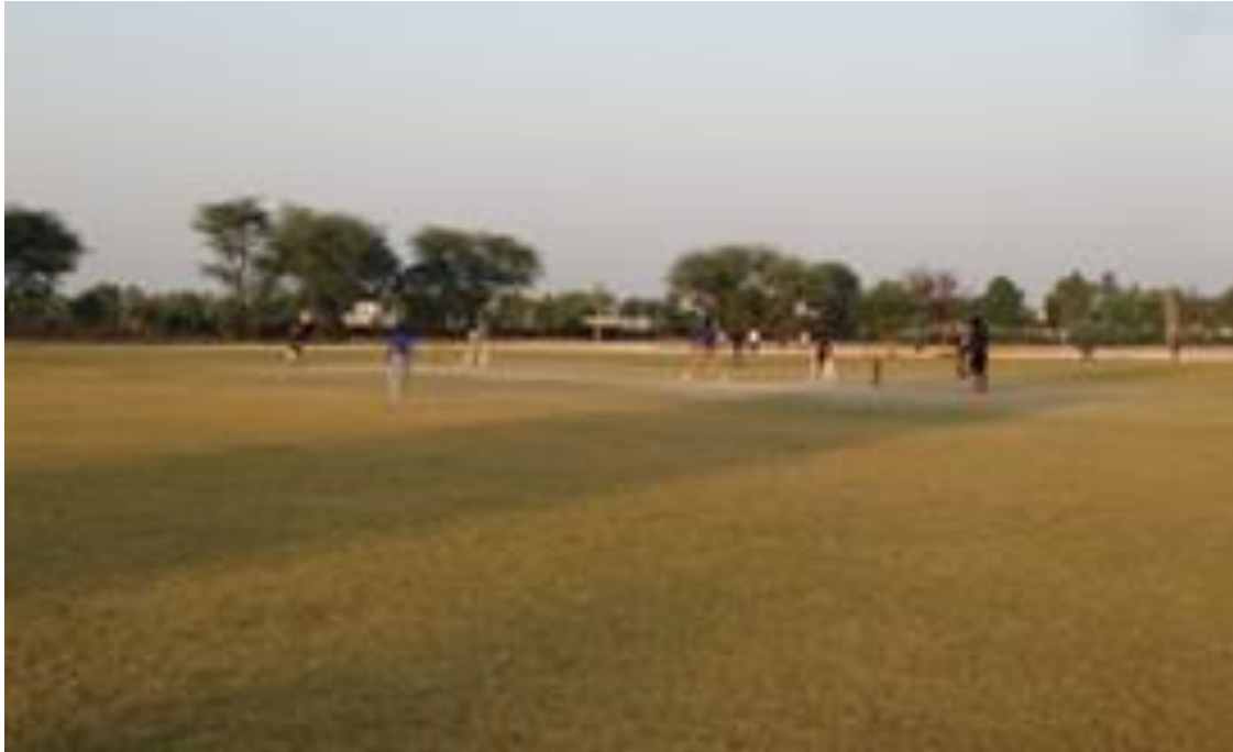
Fig 9.7.1 a Standard turf pitch cricket field