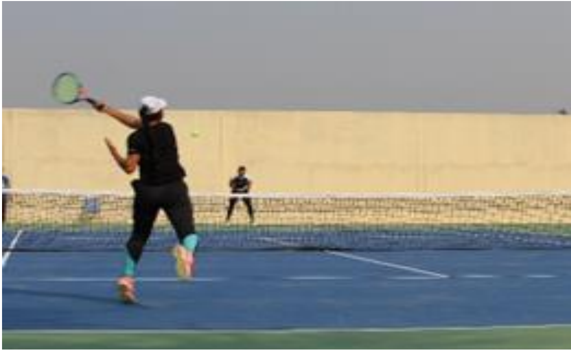
Fig 9.7.1 e Synthetic Tennis Courts