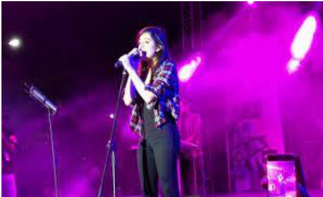
Fig 9.7.1 p (v) Various cultural events at MUJ