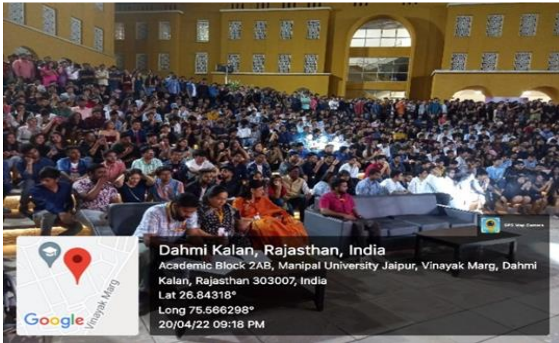
Fig 9.7.1 p (ii) Various cultural events at MUJ