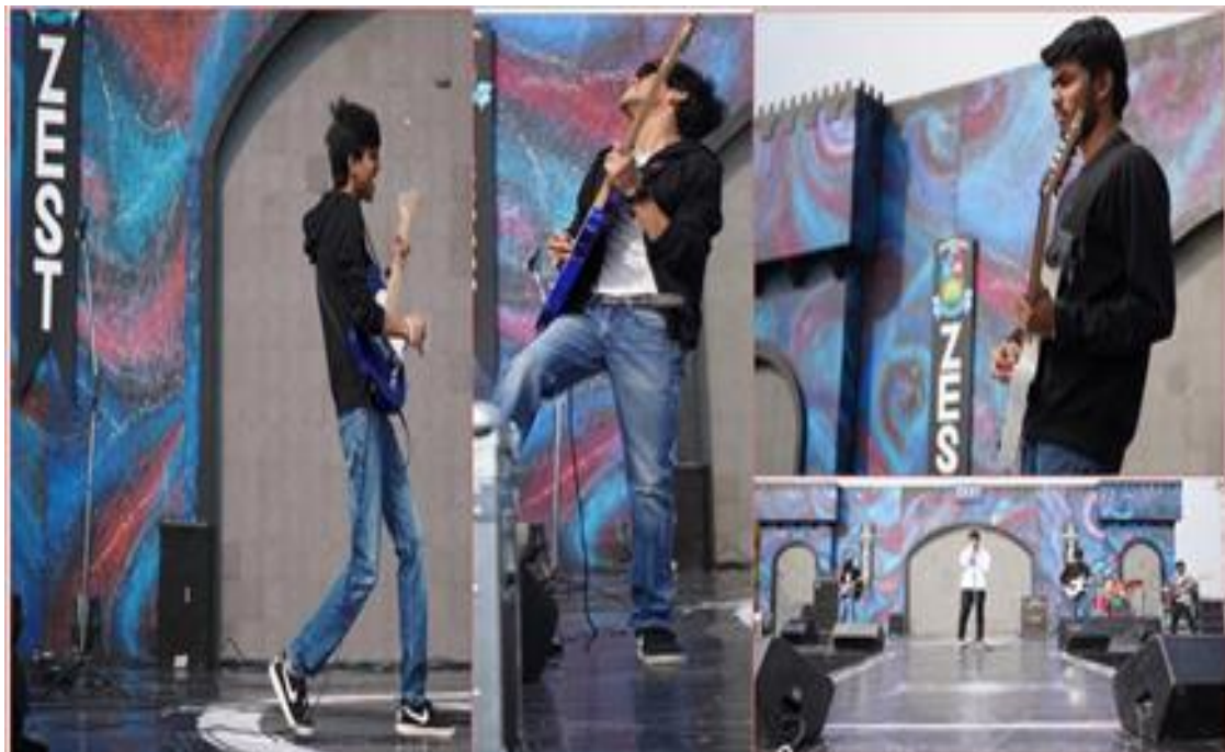
Fig 9.7.4 e Winner's trophy in the Battle of Bands competition at LNMIT Jaipur on January 28, 2020