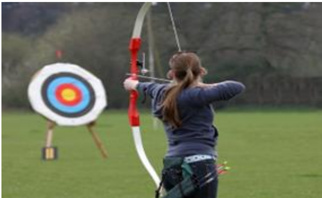
Fig 9.7.1 i Archery Field