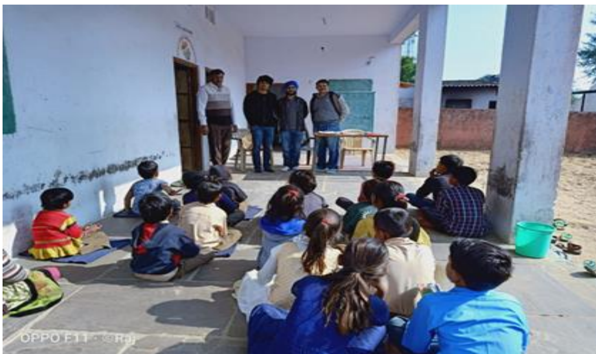
Fig 9.7.4 k Social Club Activity by panacea club in Sanjaria Govt school