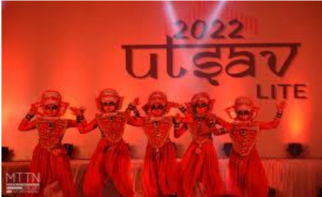
Fig 9.7.1 p (viii) Various cultural events at MUJ