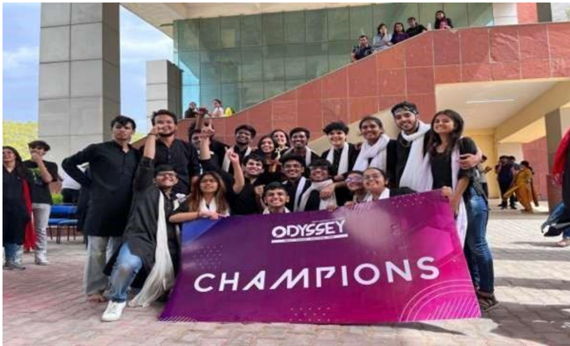
Fig 9.7.4 j Odyssey techno-cultural fest at Amity University Jaipur