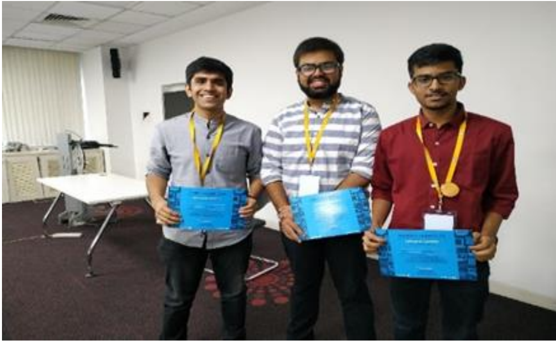
Fig 9.7.4 b Third Position TopRankers in Semicolon Hackathon 3.0, 2019 Competition