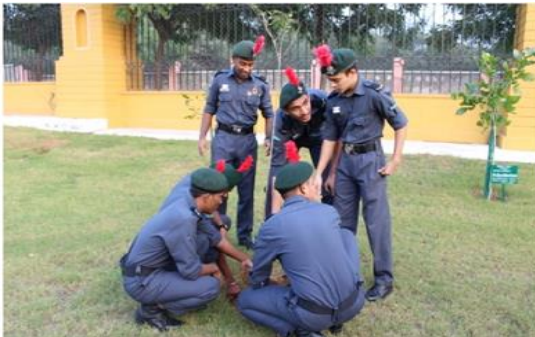
Fig 9.7 e Tree plantation drive