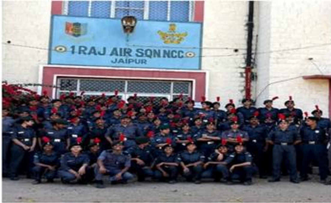
Fig 9.7 b RAJ AIR SQN NCC Jaipur