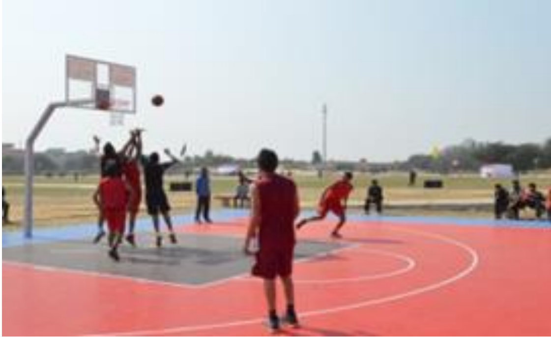
Fig 9.7.1 c Basketball field