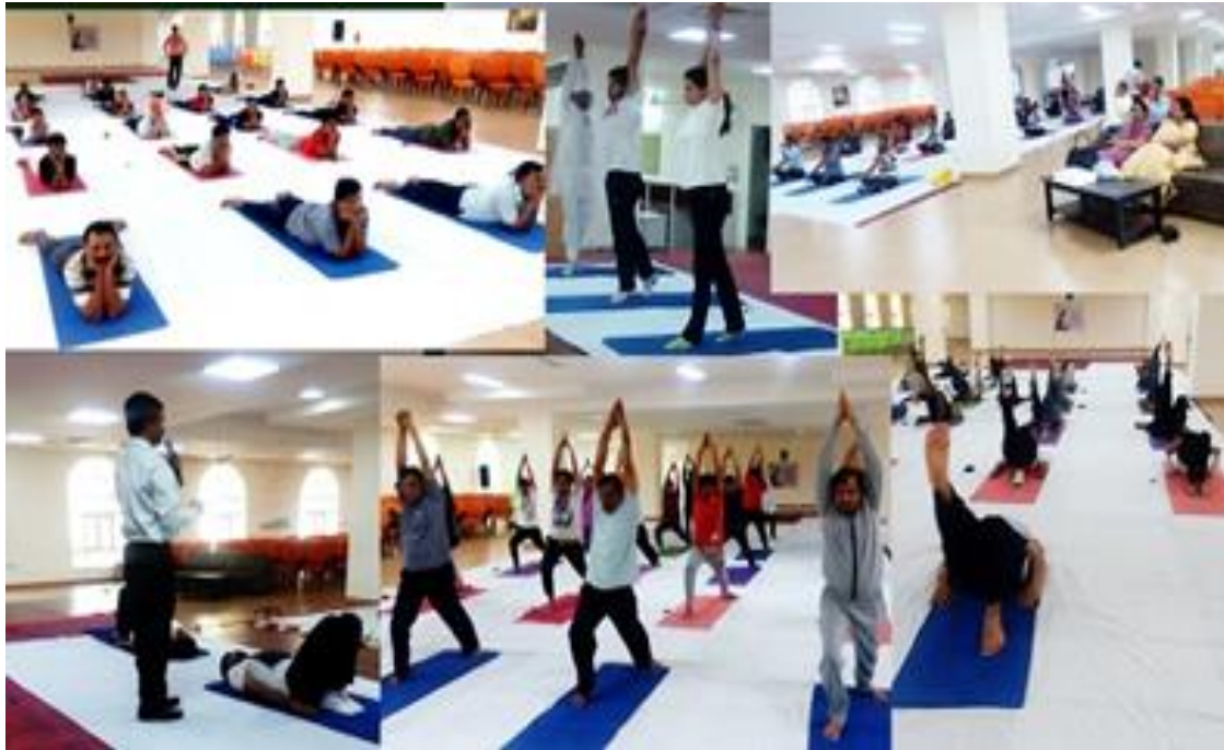
Fig 9.7.1 o (ii) Various sports activities at MUJ