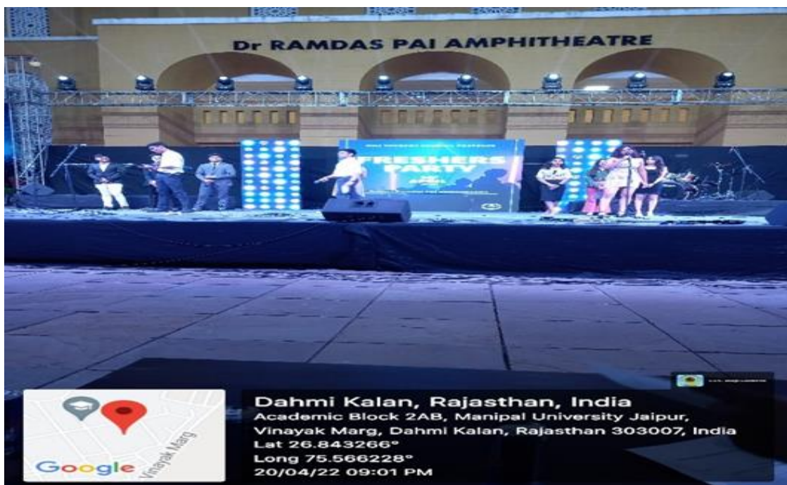
Fig 9.7.1 p (i) Various cultural events at MUJ