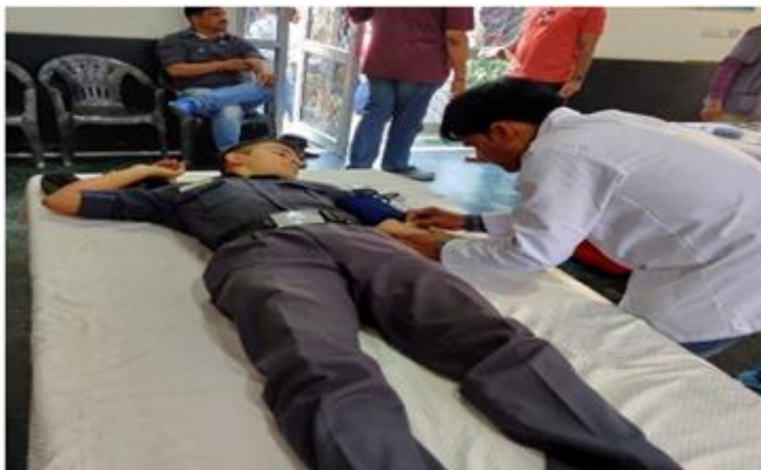
Fig 9.7 a Blood donation camp organised during 2019-20