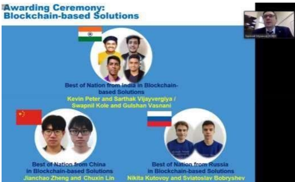
Fig 9.7.4 g Awarding Ceremony-Blockchain based solution