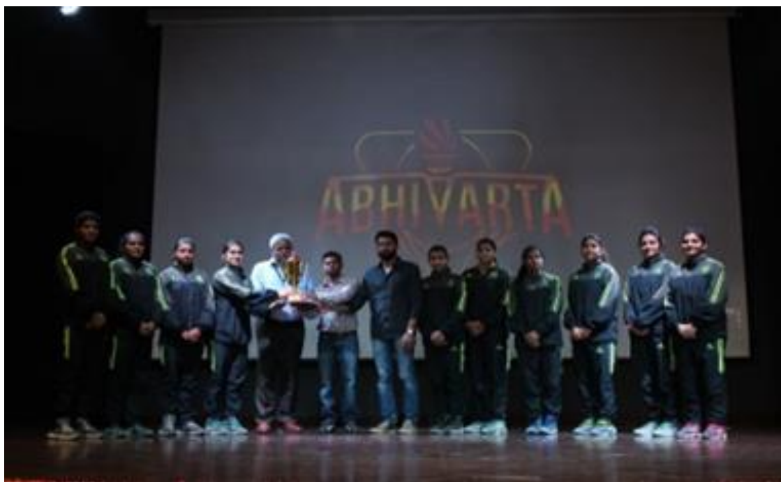
Fig 9.7.1 o (iv) Various sports activities at MUJ