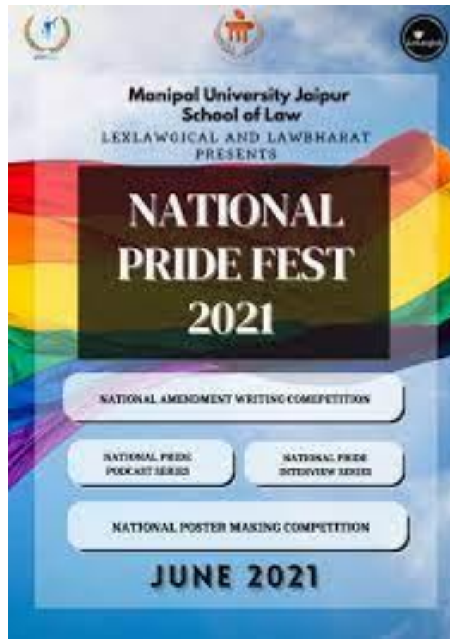
Fig 9.7.1 p (iv)