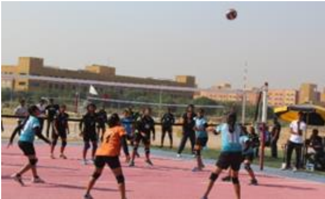
Fig 9.7.1 d Volleyball court