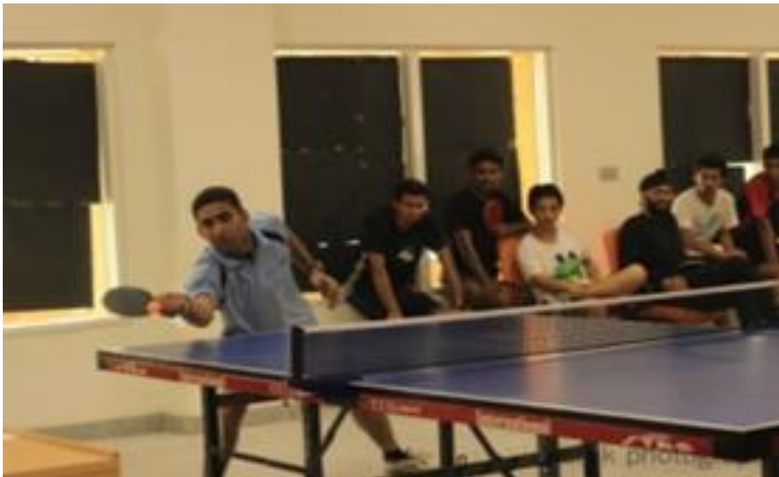
Fig 9.7.1 m chess boards