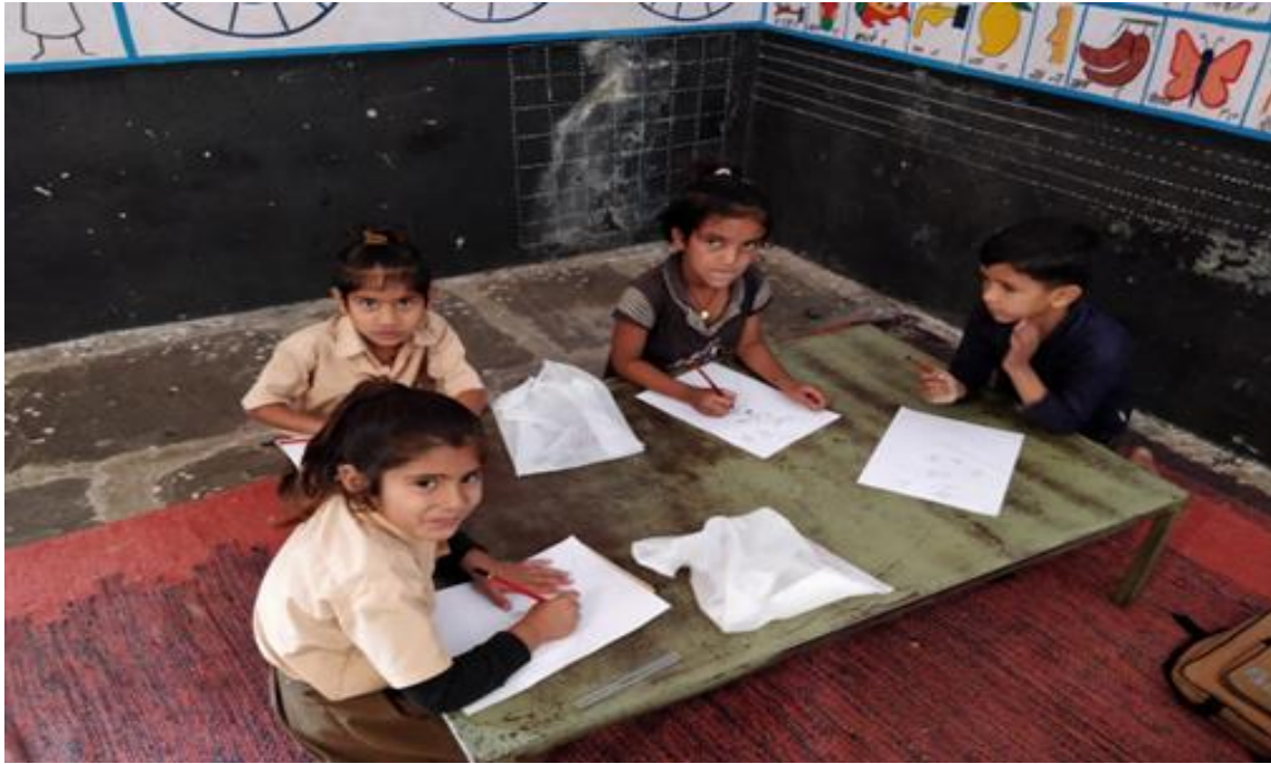
Fig 9.7.4 I(i) Social Club Activity by panacea club in Thikariya Govt school