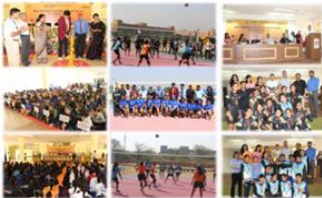
Fig 9.7.1 o (i) Various sports activities at MUJ