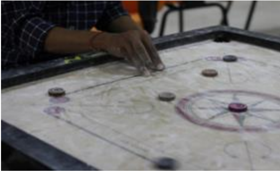
Fig 9.7.1 l chess boards