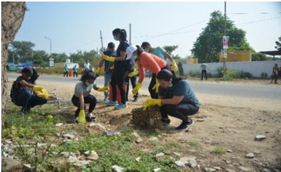
Fig 9.7.4 n Cleanliness Drive by CCE students