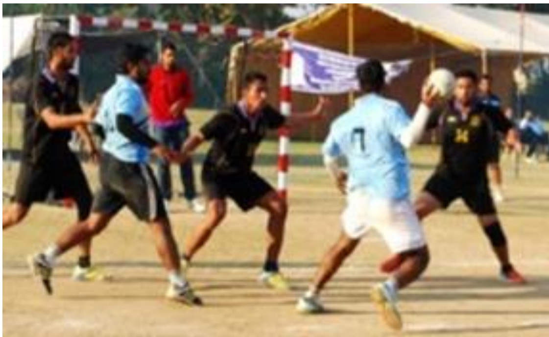
Fig 9.7.1 h Handball Field