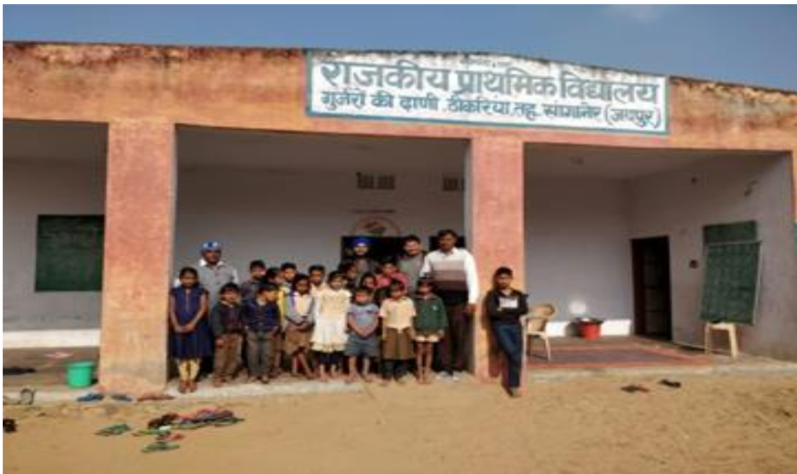
Fig 9.7.4 I (ii) Social Club Activity by panacea club in Thikariya Govt school