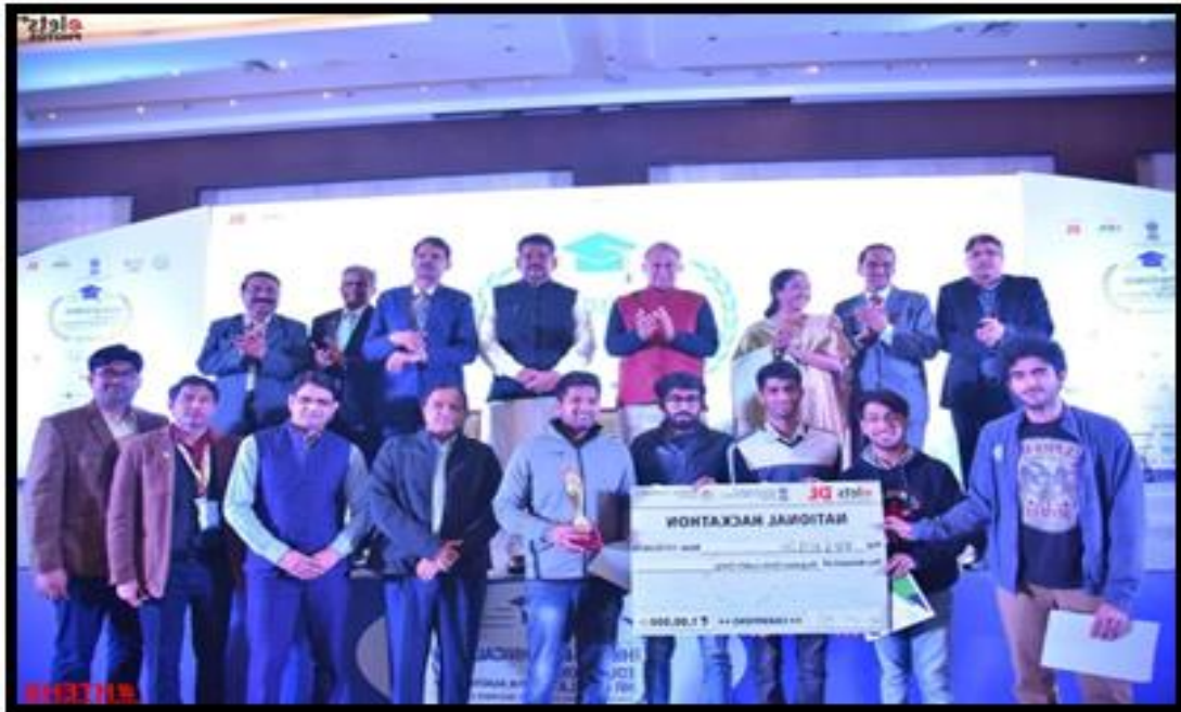
Fig 9.7.4 c Won I Prize of Rs. 1,00,000 in National Hackathon 2019