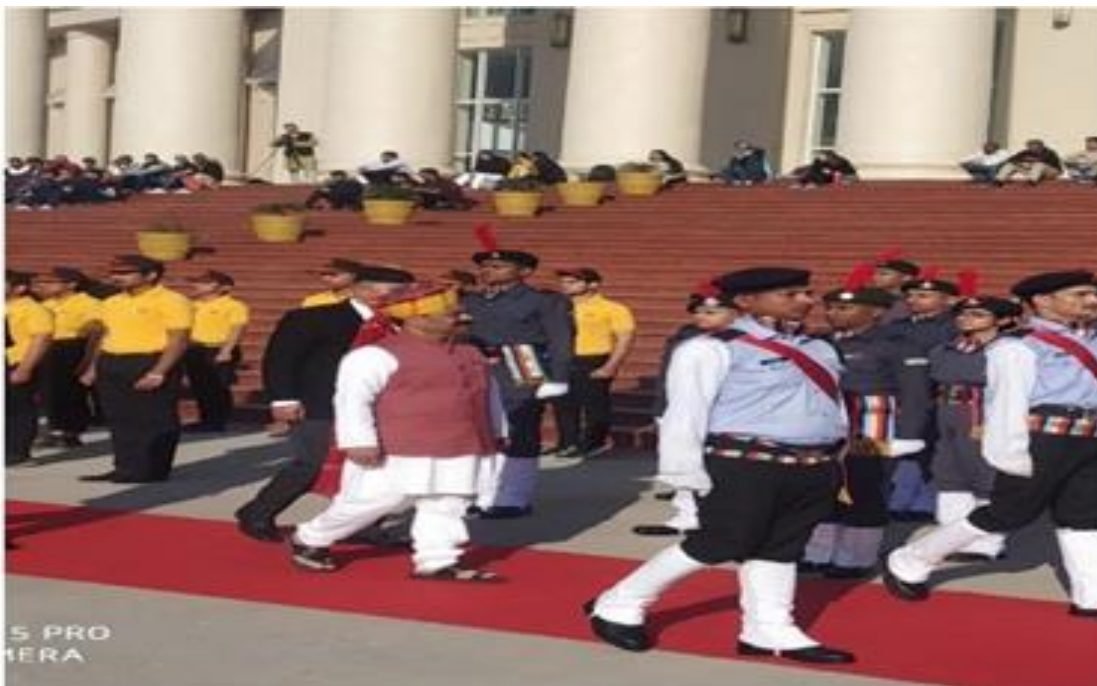
Fig 9.7 c Republic Day Parade 2020