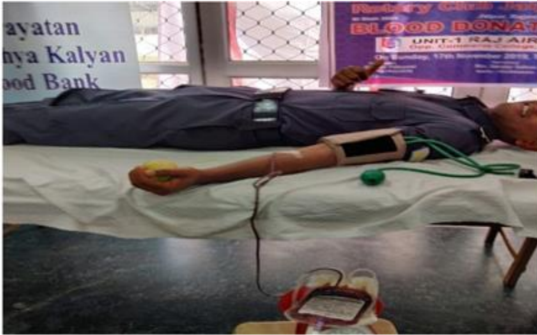
Fig 9.7 d Medical chekup camp