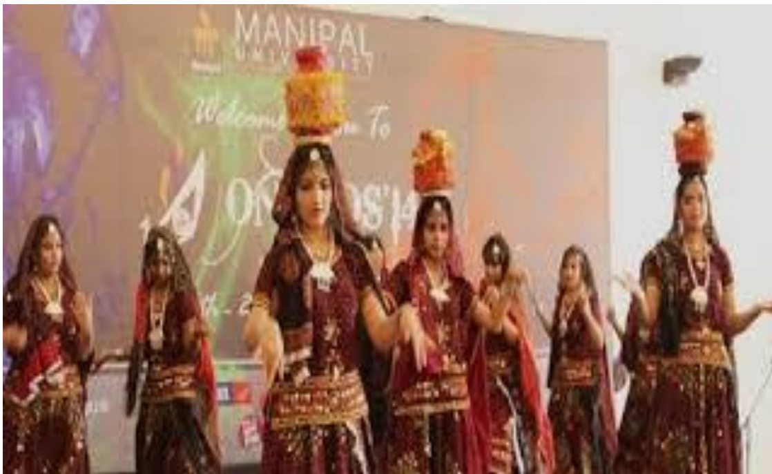
Fig 9.7.1 p (vii) Various cultural events at MUJ