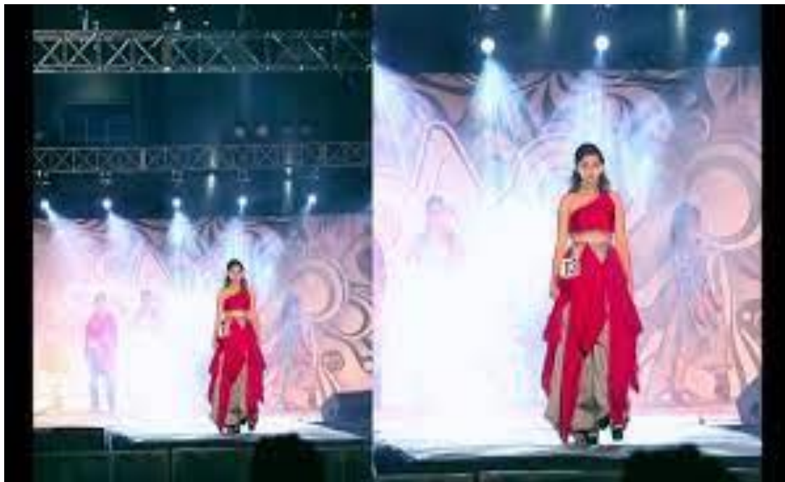
Fig 9.7.1 p (iii) Various cultural events at MUJ