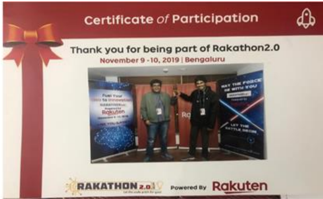
Fig 9.7.4 d Rakathon-CCE Student team "oPTIMIZE" placed 10th in the E-Commerce category, 2019