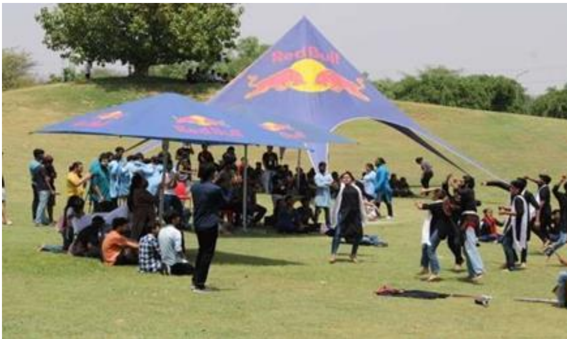
Fig 9.7.4 i Performance By CCE students at official theatre of MUJ-Utkraant