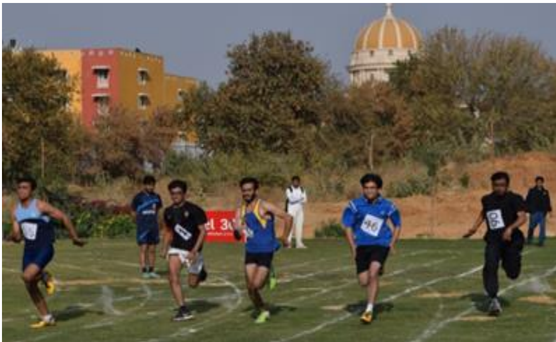
Fig 9.7.1 f Athletic Track