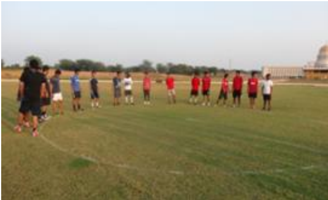
Fig 9.7.1 b Football field