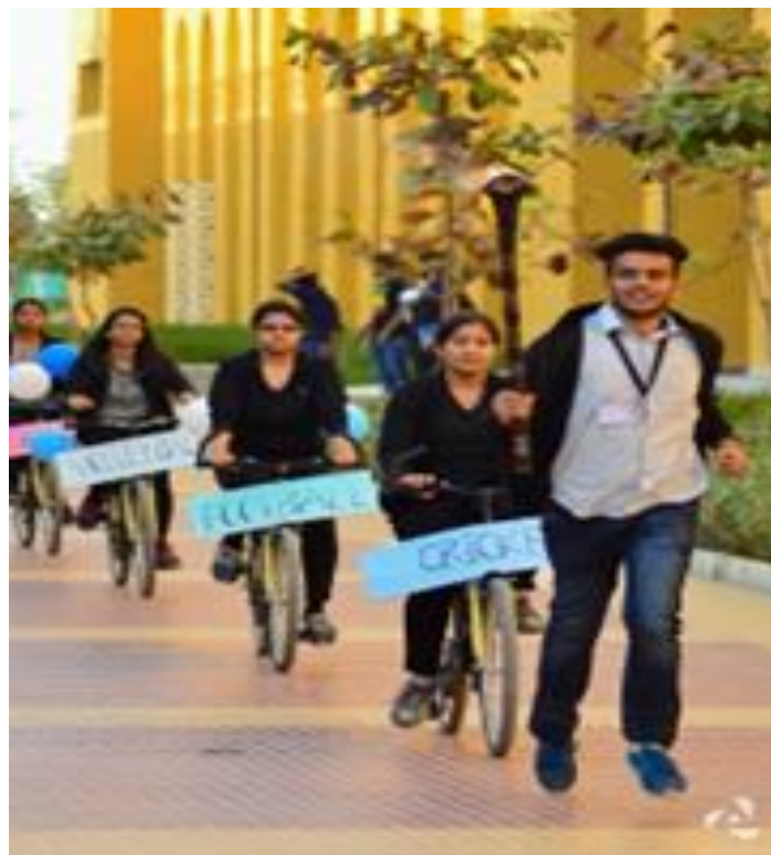
Fig 9.7.1 o (iii) Various sports activities at MUJ