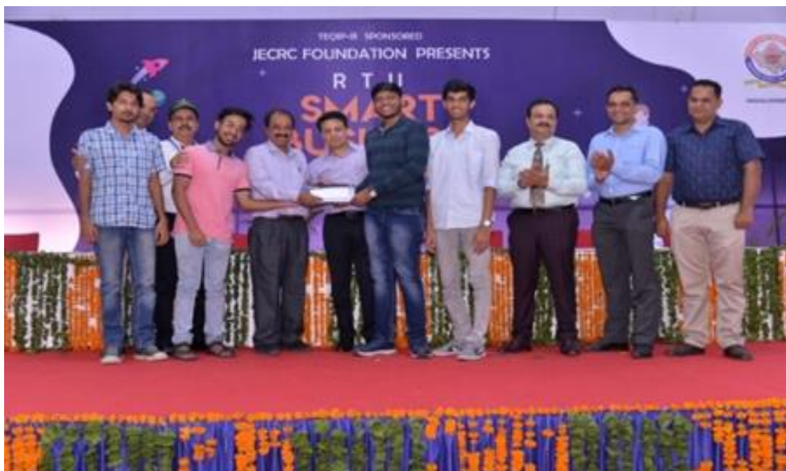
Fig 9.7.4 a Special Recommendation Award with Prize Money Rs. 11000/- in RTU Smart Business Hackathon Sponsored by TEQIP III- 2019