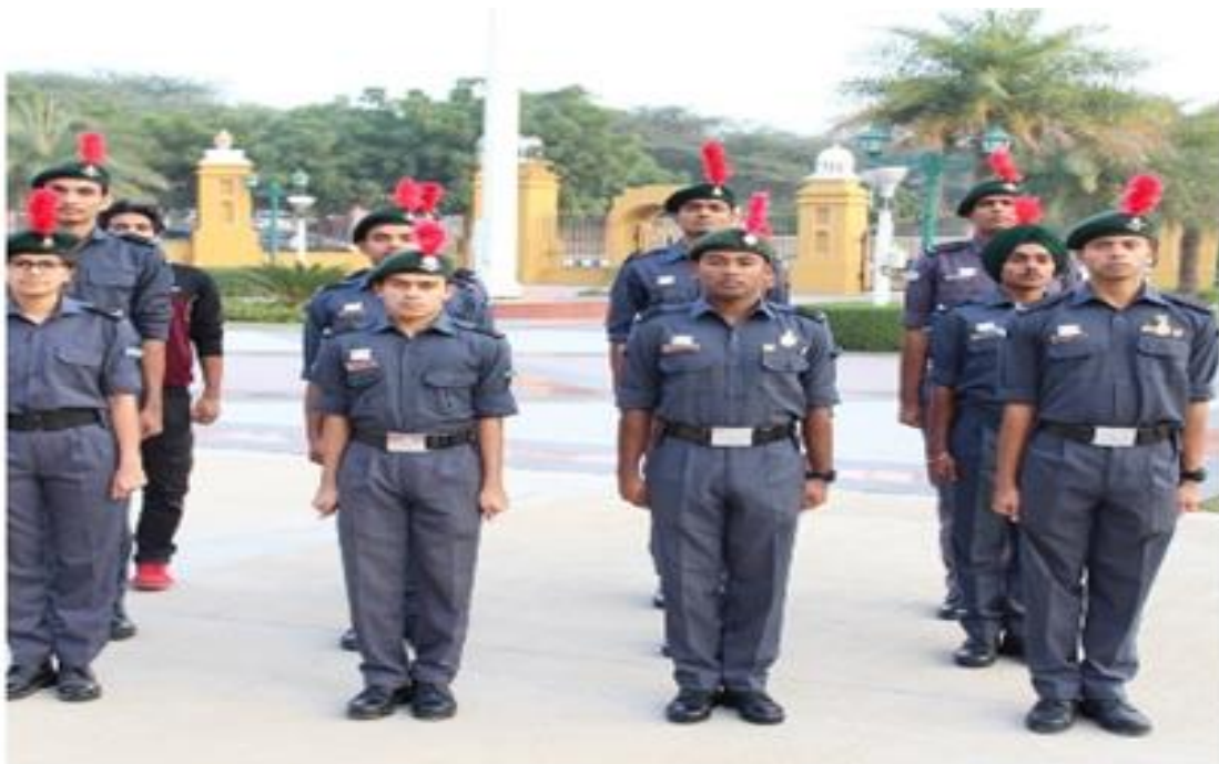
Fig 9.7 e Independence day celebration, participation of NCC cadetes