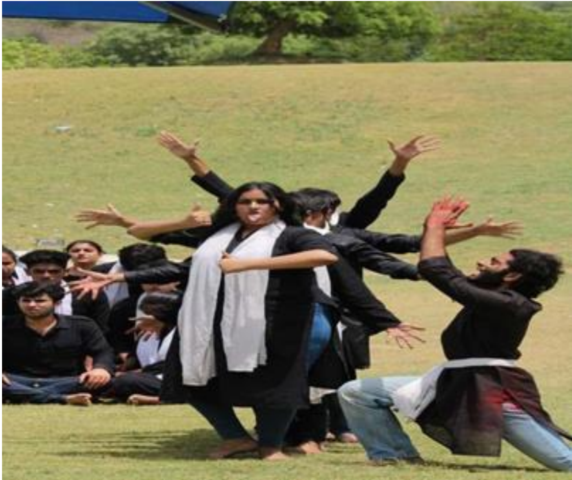
Fig 9.7.4 h Won third prize in street play competition at NIIT Alwar