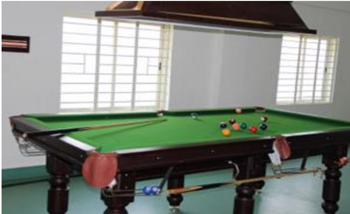
Fig 9.7.1 j Snooker and pool tables