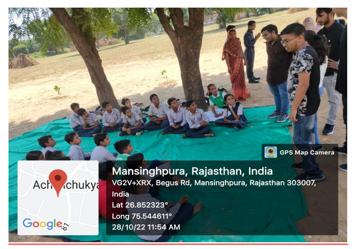
Fig. 1: MUJ students explaining rules to students