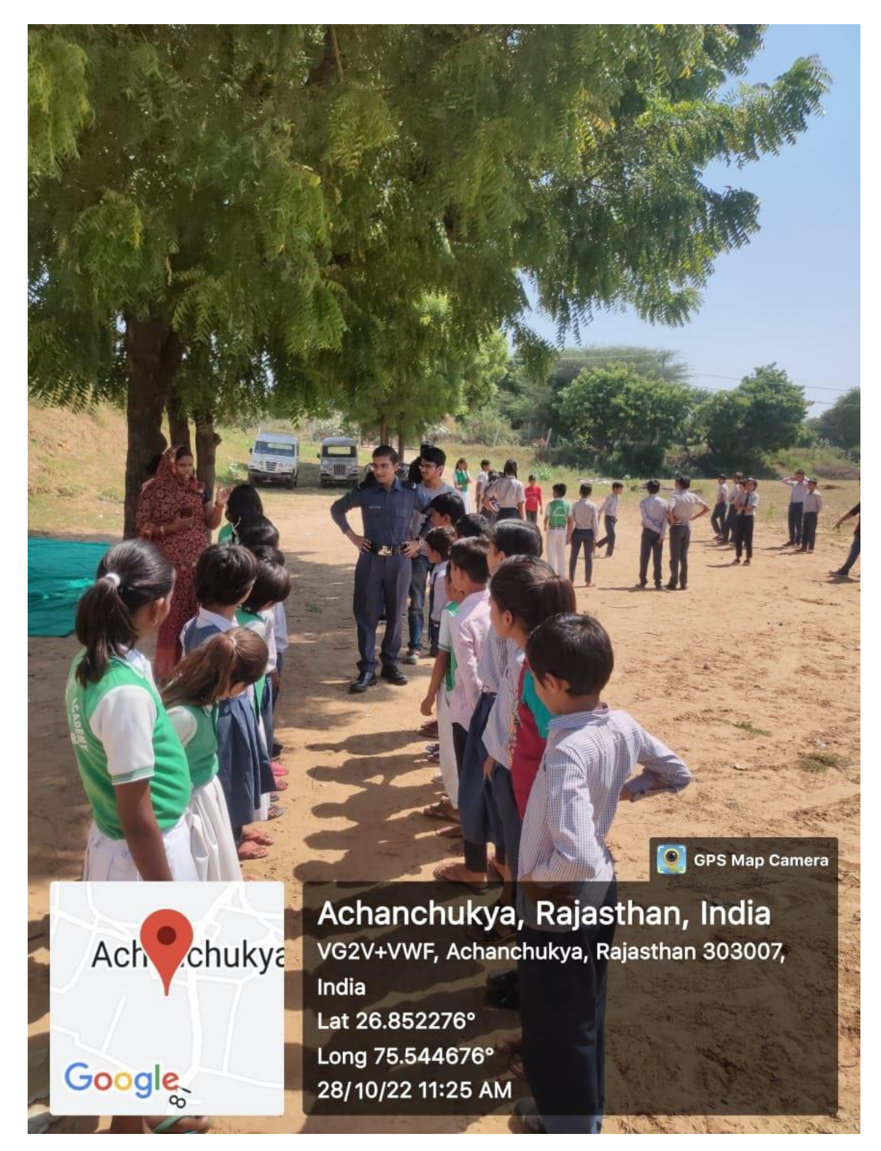
Fig. 4: Student playing games at School