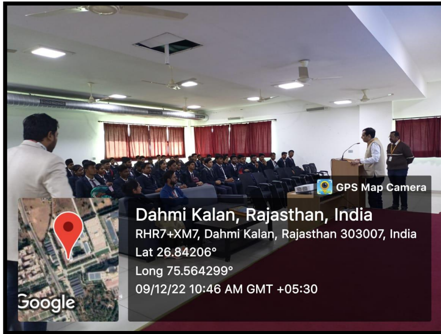
Figure 5.1 Students participating Career Counselling Session