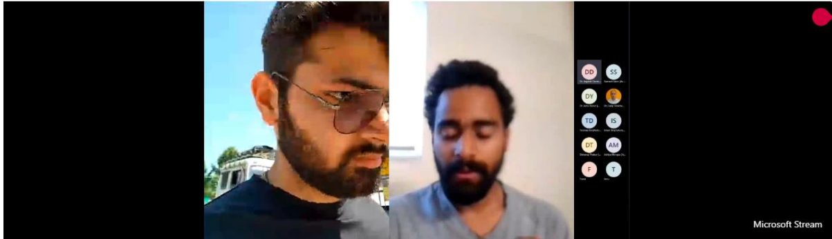
Alumnus Explaining about his experiences