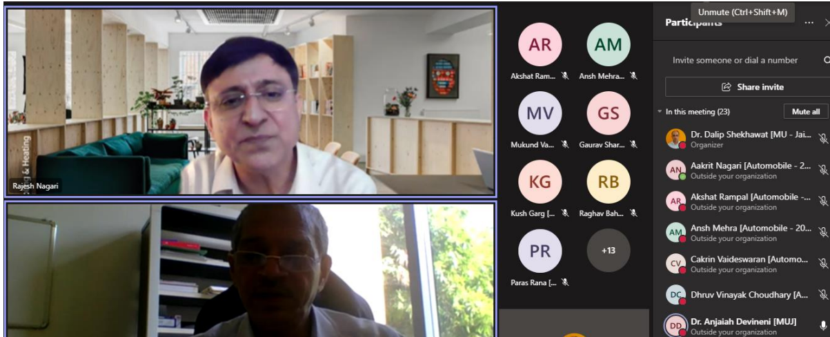
Fig 4. Group photos