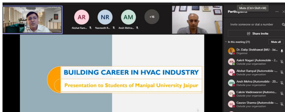
Fig 2. About air conditioning industries