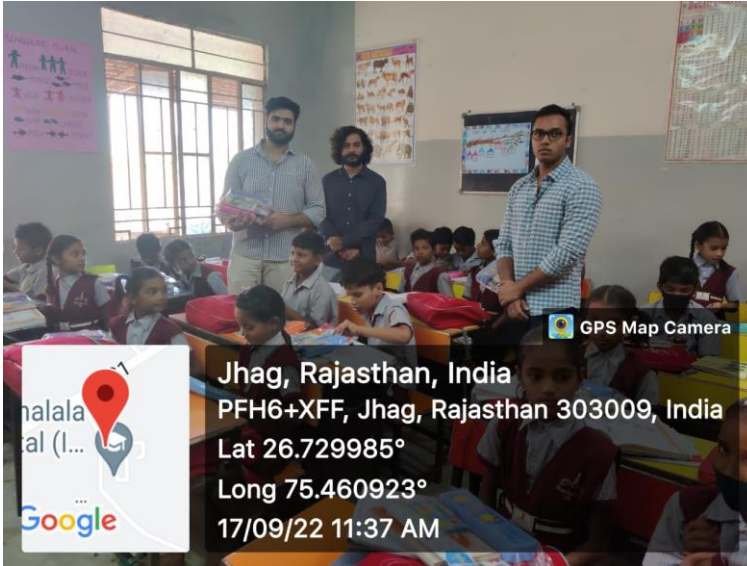
Pic 2: Students of MUJ distributing kits to School Kids