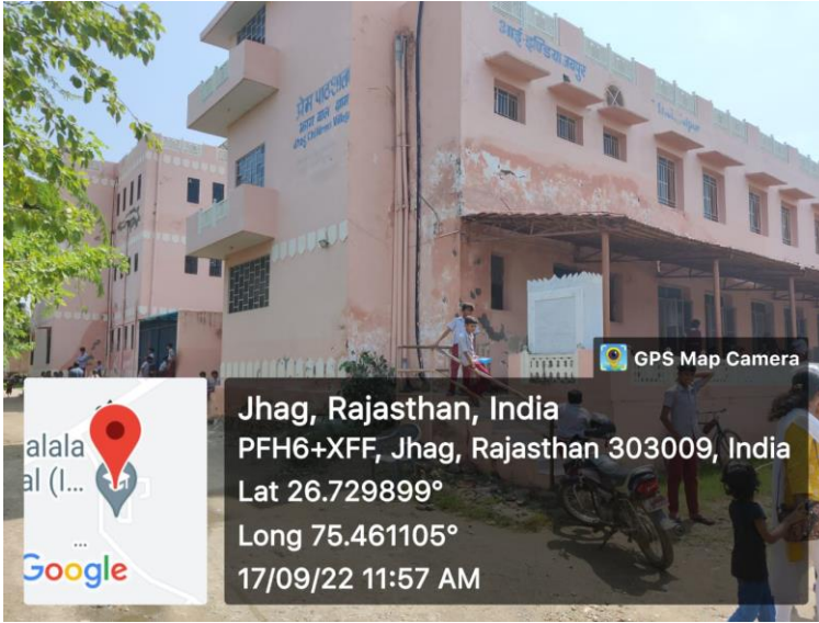
Pic 1: Prem Pathshala Secondary School Jhag, Jaipur