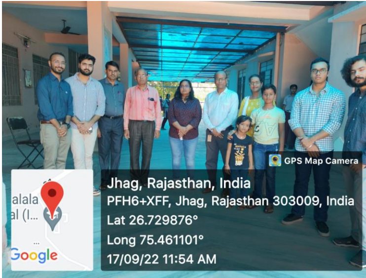
Pic 4: Faculty and Students of MUJ with the School Principal