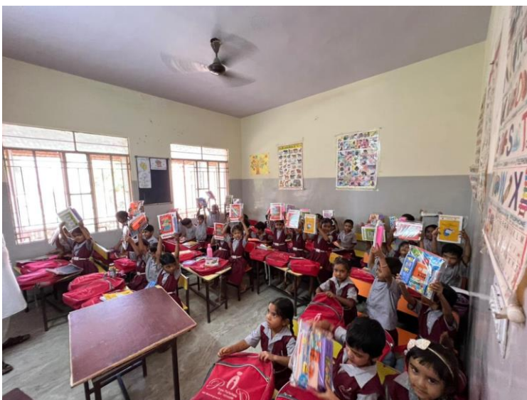
Pic 3: Smiling kids after receiving kits