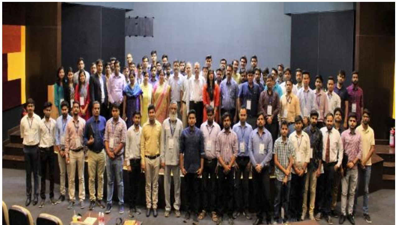
Participants from the Department of Civil Engineering