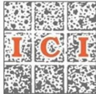
Indian Concrete Institute