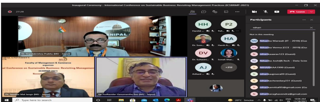
Inaugural Ceremony of the Conference on 18 th November 2021

The Conference was a grand success with four technical sessions in which various academicians, research scholars and industry experts presented over 90 research papers and deliberated on various streams of management such as, Finance, Strategy and Entrepreneurship, Marketing, Human Resource Management, General management and other related domains.