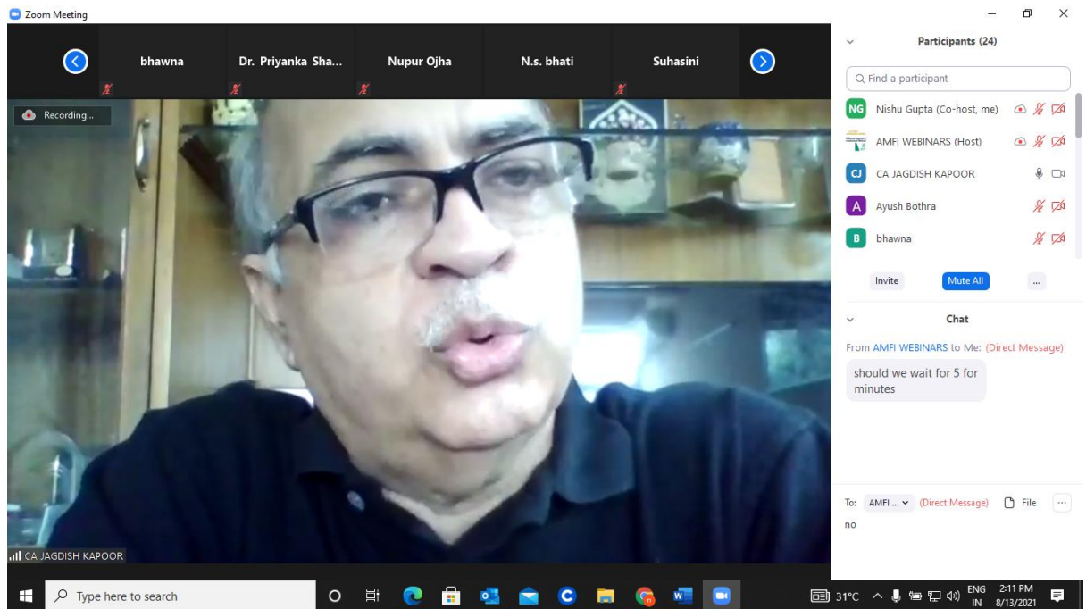
Handling students Queries.