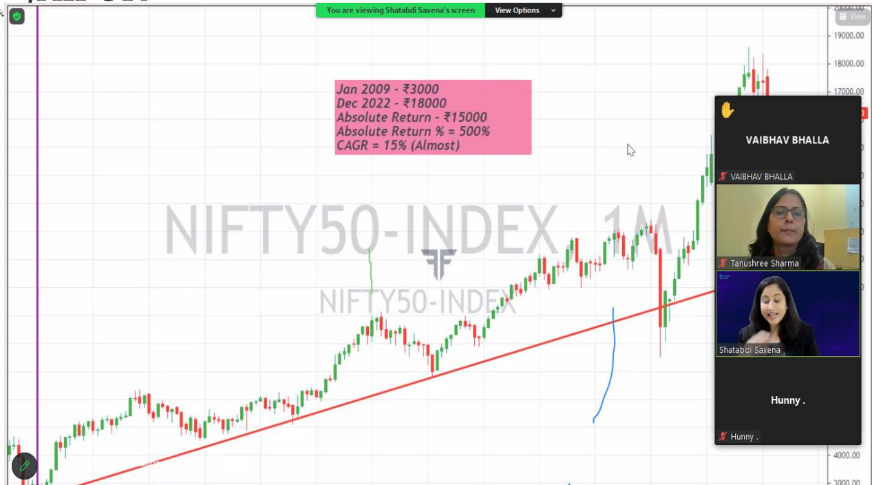
Figure 3 Expert Explaining the Technical Charts of Stock Market.