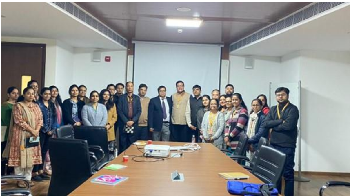
Group Photograph of the Participants with the Guest