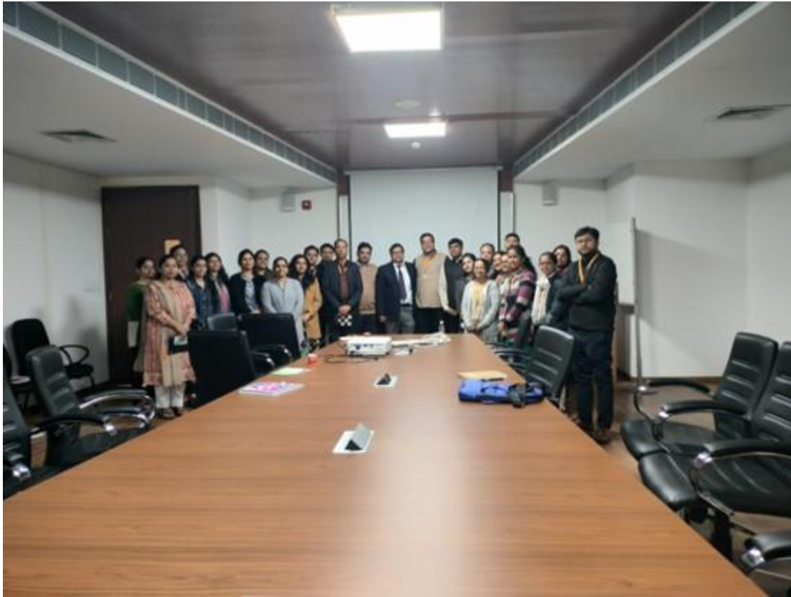
Group Photograph of the Participants with the Guest