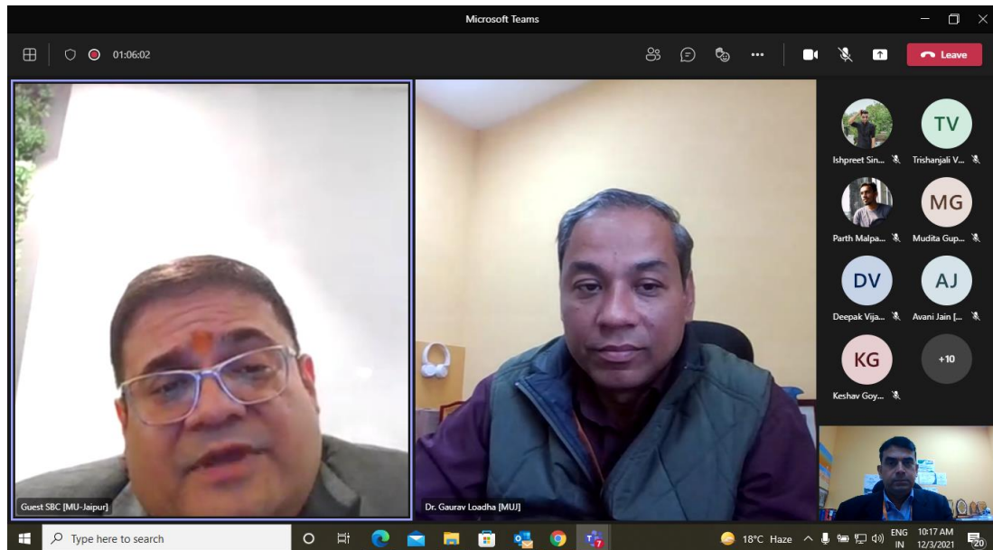
Figure 2 Expert shared his experience