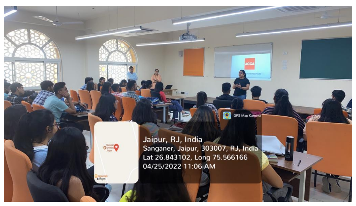
Sharing the knowledge about ACCA and its future prospects