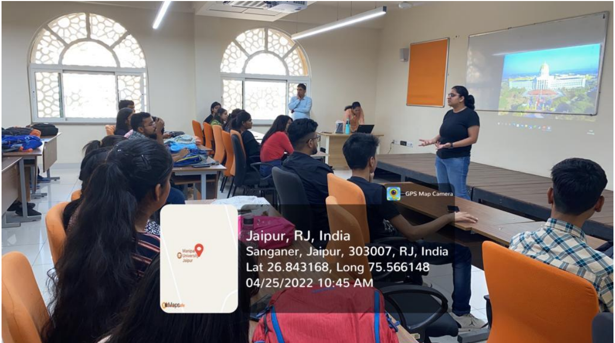
Interacting with B.Com (Hons) First year students