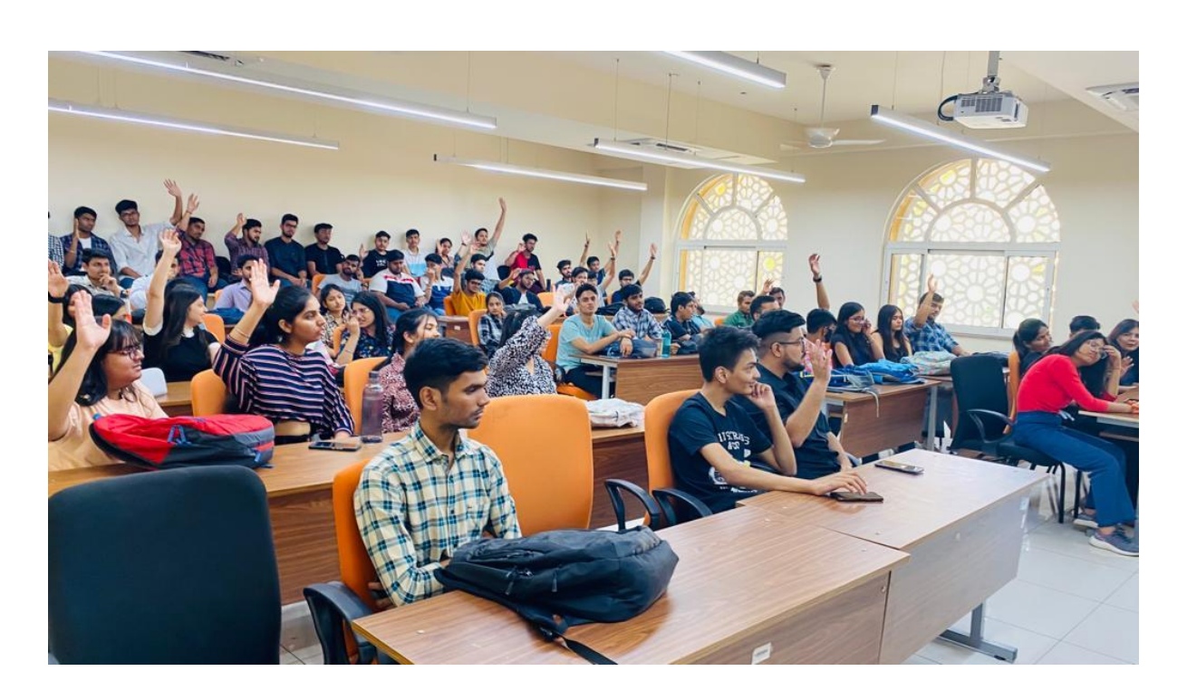
Interacting with B.Com (Hons) First year students