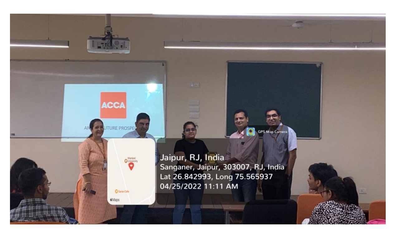
Momento to alumni by Director, DoAR and Head, Department of Commerce Page 9 of 13 EXPERT LECTURE ON ACCA AND ITS FUTURE PROSPECTS