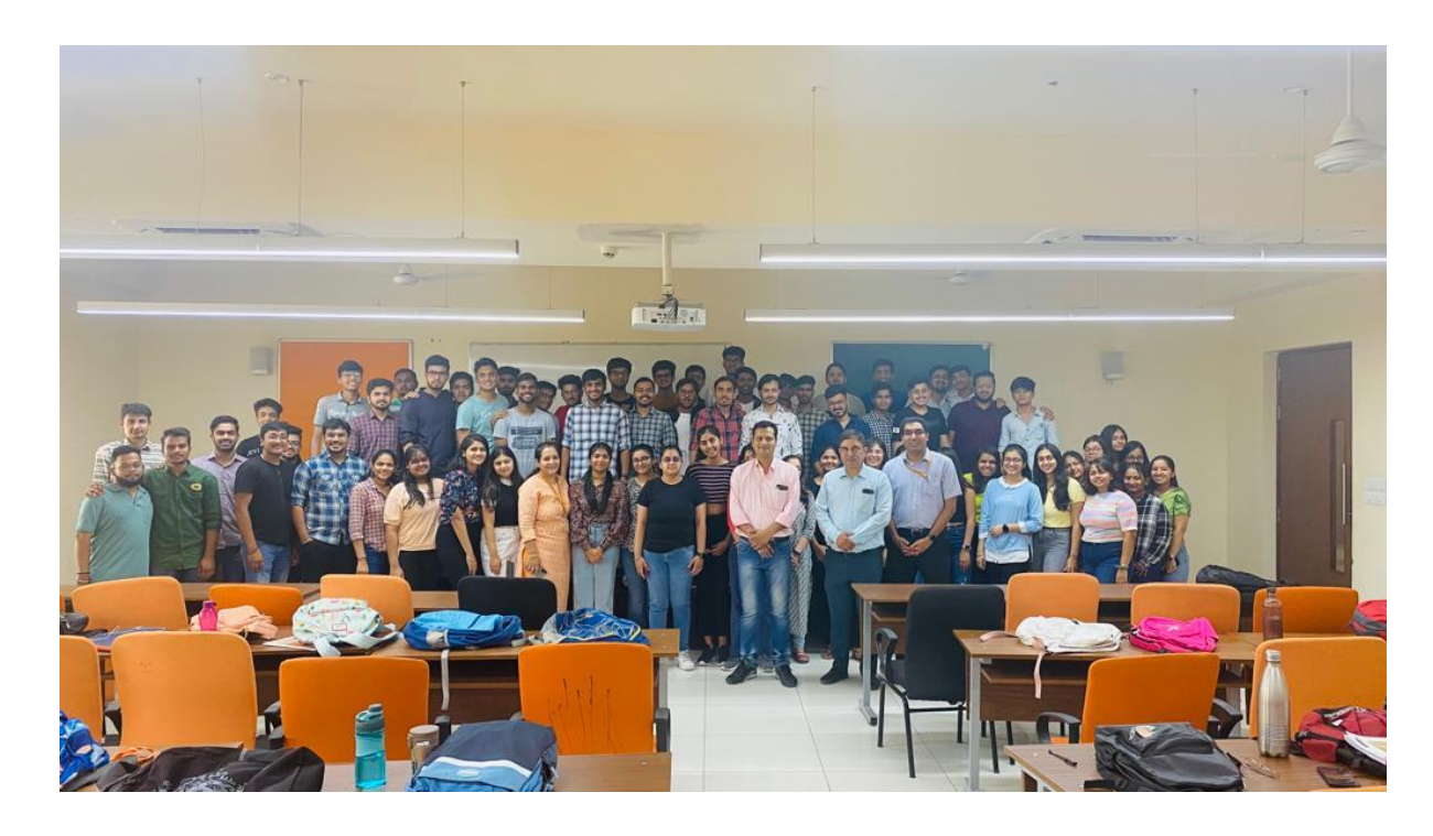
Group Photograph with Alumni