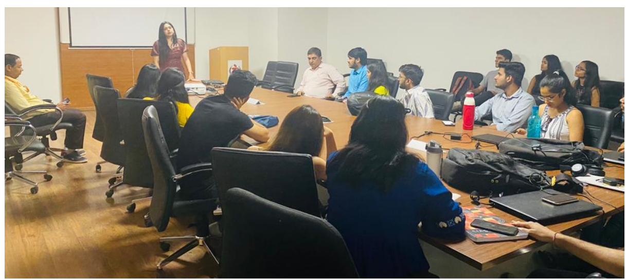
Interacting with B.Com (Hons) Final year students