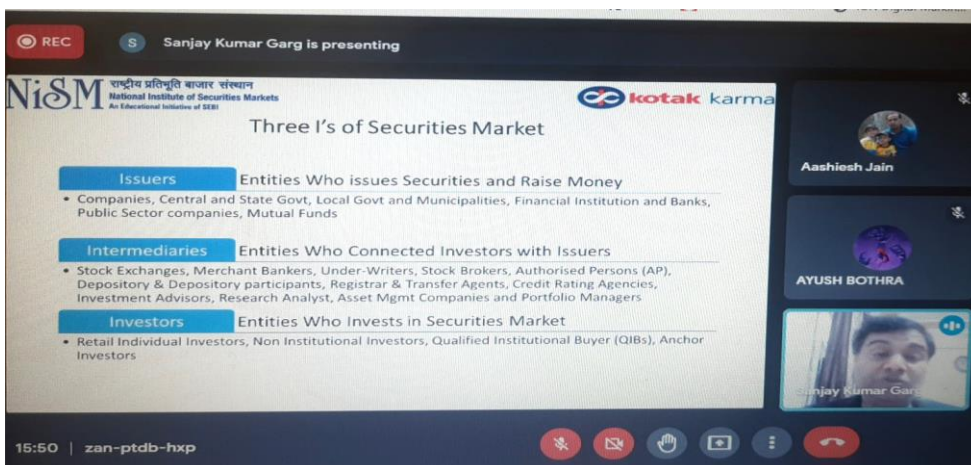
Expert interacting with attendees