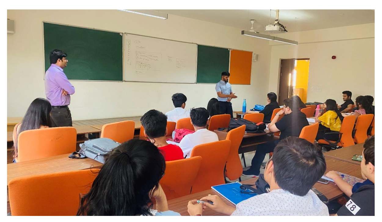
Photograph 1: Interaction with students