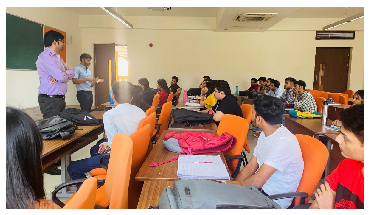
Photograph 3: Problem solving of the students