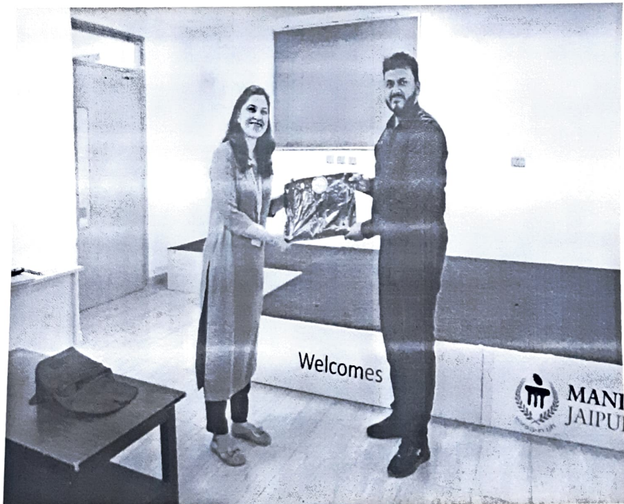
Presenting T-Shirt to the Guest