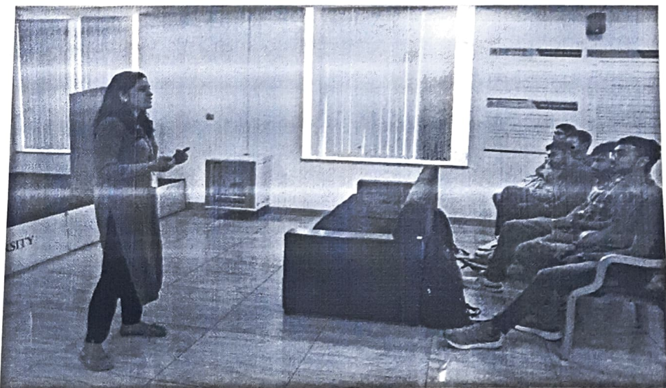
Guest delivering lecture.