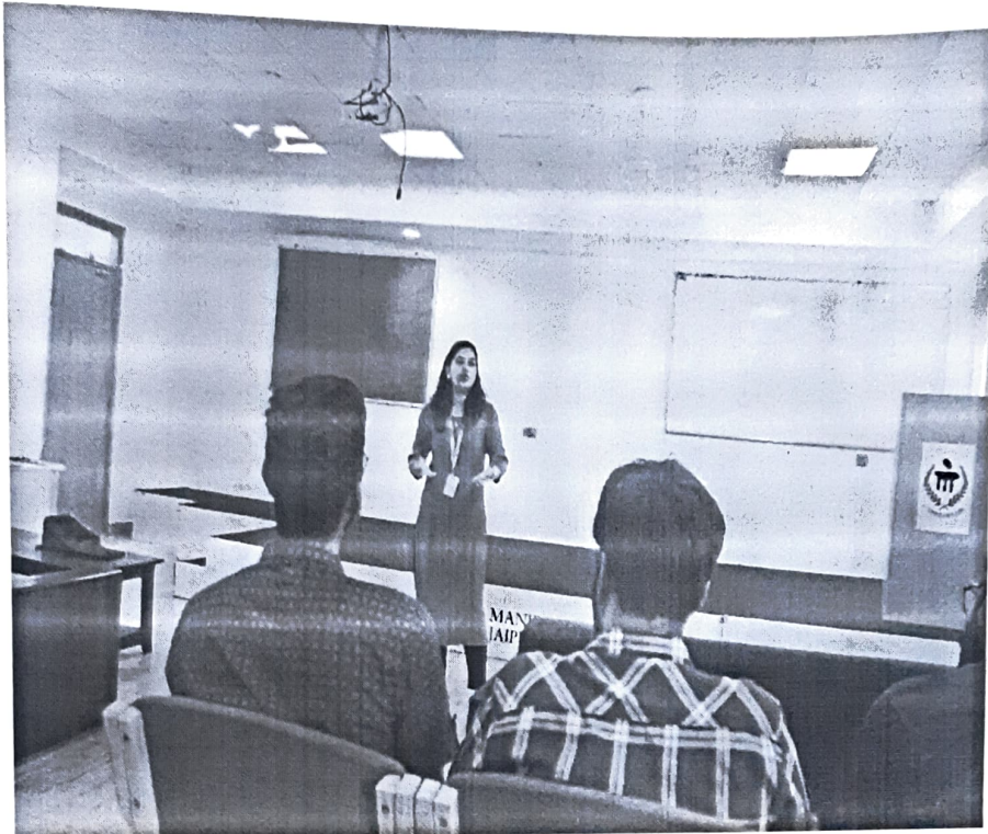
Guest interacting with the students.