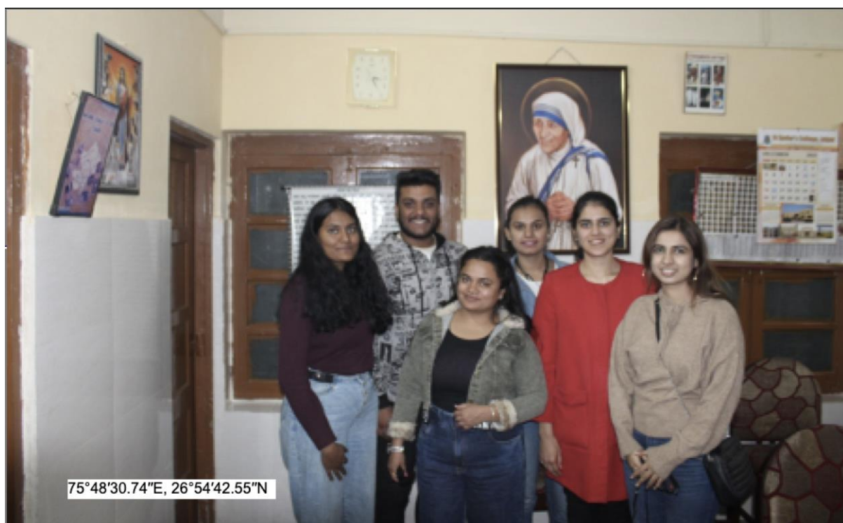
Students at the Centre's Office