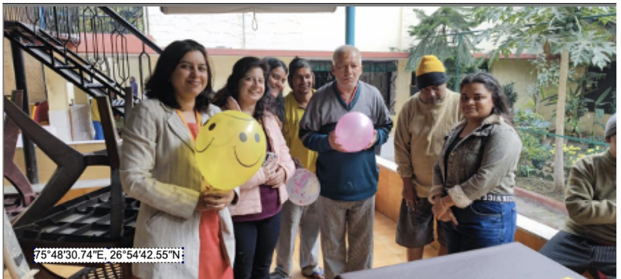
Faculty and Students with the Inmates