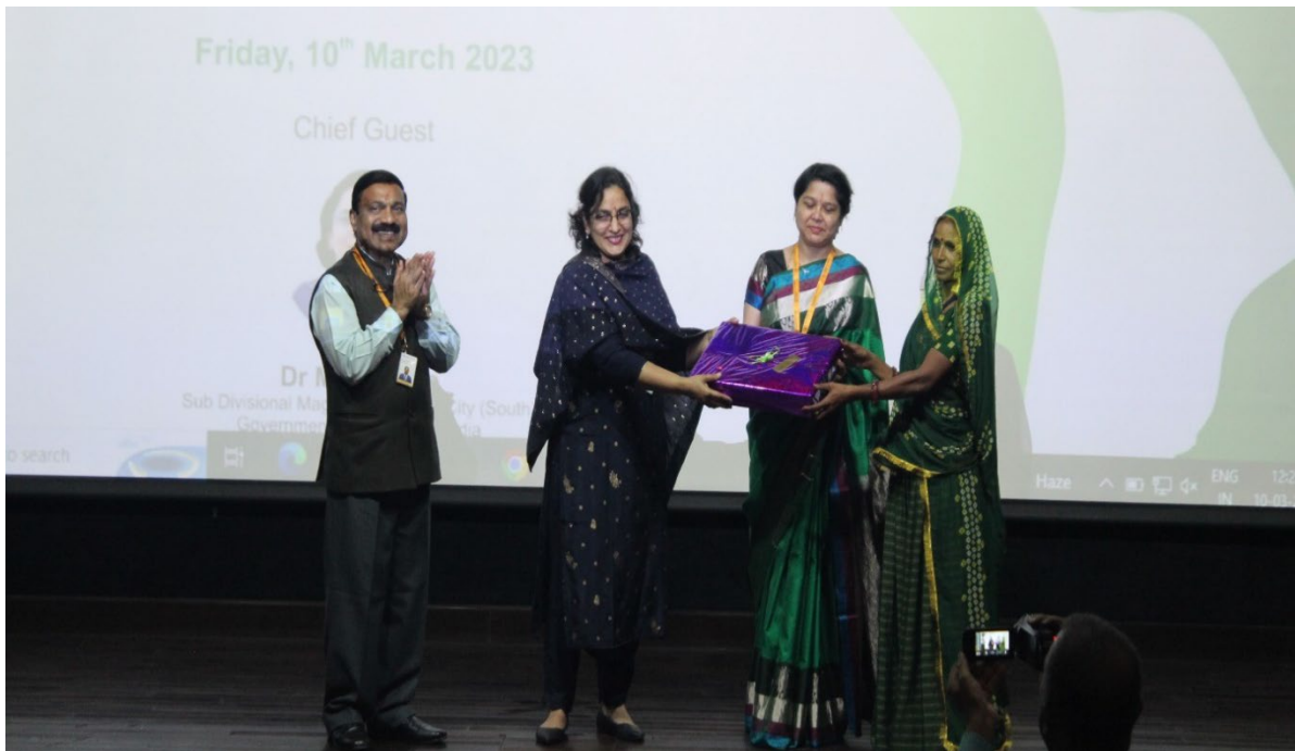
Felicitation of the Service Providers