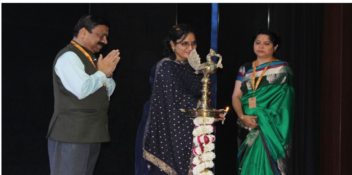
Lamp lighting ceremony