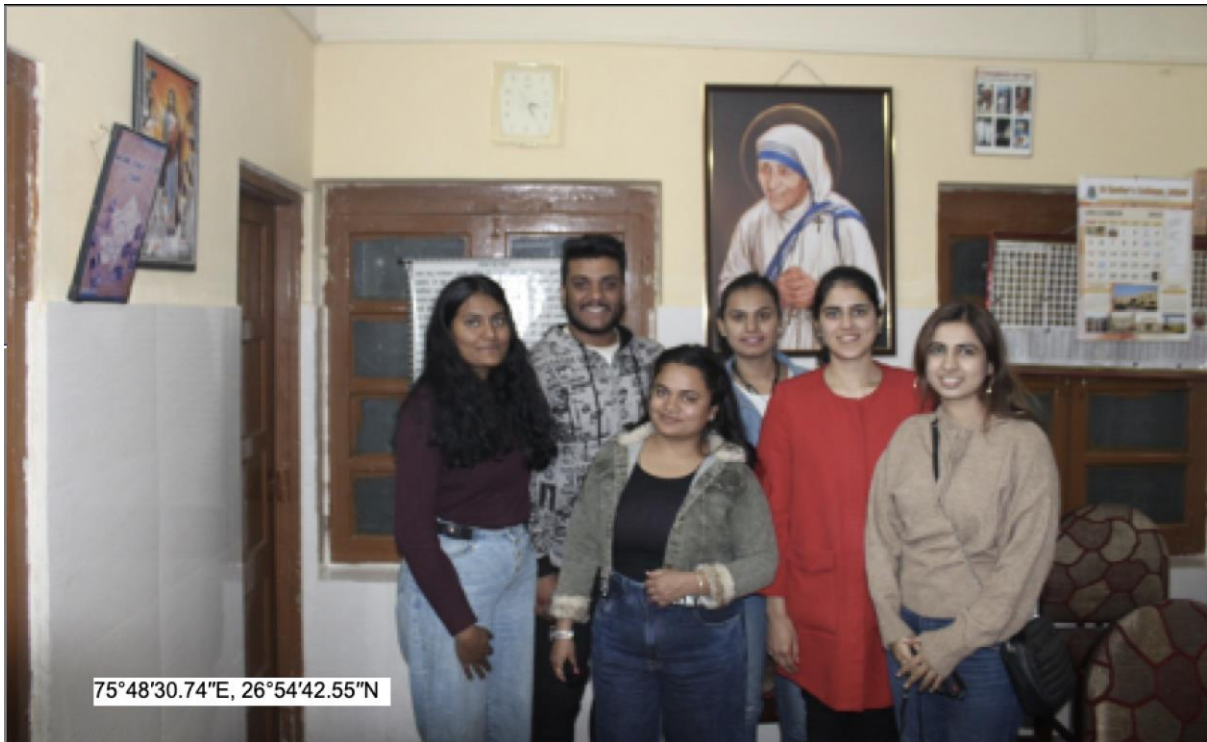
Students at the Centre's Office